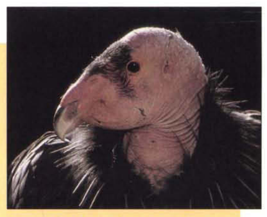
Conservation funds often go to endangered species that enjoy vocal public support, such as condors.

Even if regulators did not face these obstacles, priority-setting would be in trouble because the current system needs improvement. While many have criticized the current system for setting conservation priorities, few have suggested concrete ways of improving it. At one extreme, we could divide the money equally among the listed species. Another approach would be to save as many species as possible by fo-