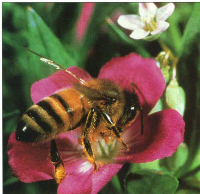
Toxic and "broad spectrum" pesticides often kill unintended targets such as honeybees.

However, the area remains in a state of ecological deterioration due to additional factors. The Lower Klamath portion and parts of Upper Klamath Lake in particular still support abundant natural biodiversity, both resident and migratory species because of wildlife management. However, other parts of this four-lake wildlife refuge system (especially the Tulelake NWR) are considered so changed environmentally and so intensively oriented to agriculture that wetland restoration will be necessary to restore biodiversity needs on the refuge lands. At Tulelake NWR, newer pesticides (such as safer organophosphates) are still used on lease-lands, and might still harm wildlife. Large portions of the Tulelake refuge have almost no natural or even managed habitat due to the use of "clean-farming" and monotypic farming techniques, such as planting large areas with one type of crop. Currently, agricultural scientists are working with wildlife managers to change the agricultural, monotypic environ-