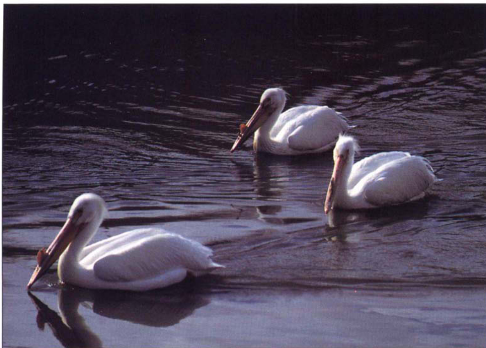
American white pelicans feed in an irrigation canal in the Central Valley. Canal water not only transports toxicants and salts to waterways throughout the state, but can directly affect fish and wildlife using the water. In areas of limited habitat, canals may be the only place for many of them to feed.

happened so fast that in many instances, such as in the northern Appalachian area, people did not realize breeding peregrine populations were gone until some surveys were done. This basically happened between systematic surveys for the bird. Other raptors such as osprey and bald eagles also were reduced by biocides. Fortunately, various programs such as the worldwide "Peregrine Fund" and the UC Santa Cruz-based "Predatory Bird Research Group" have had remarkable success in breeding threatened raptors in captivity and reintroducing them all over North America.