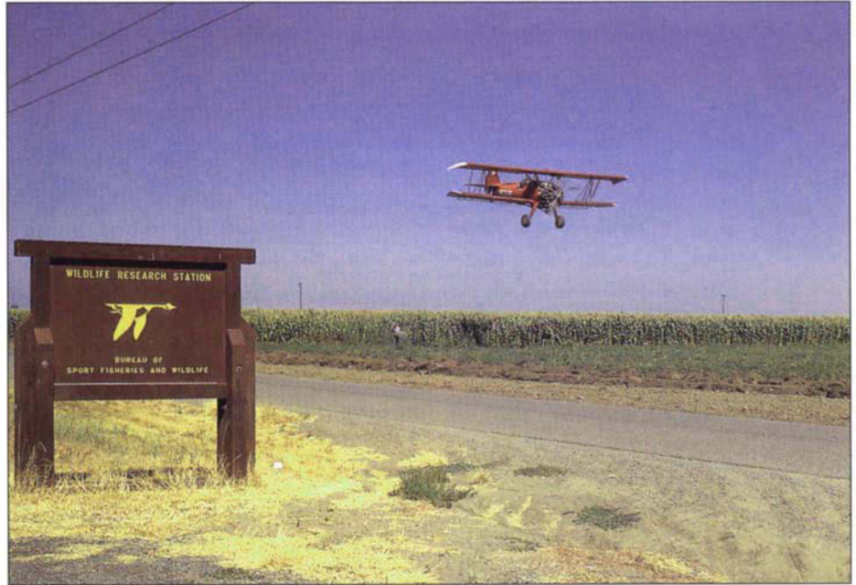
The agricultural spraying of toxaphene pesticide near wildlife habitat in 1971. Toxaphene has been replaced with more effective and safer pest-control agents.

While biocides, or pesticides, are designed to kill agricultural pests, many of these toxicants have the unintended effect of depleting natural biodiversity. Determining the specific effect of a biocide on biodiversity is complicated because other factors, such as direct habitat loss, also decrease biodiversity. Both in California and nationwide, farmers have been among the first biocide-users to respond to the challenge of reducing unintentional contamination of the environment. As a result, today agriculture faces many fewer biocide-diversity conflicts than it did even a decade ago. Changes in use of biocides have led to recoveries of many previously affected populations of birds, which are perhaps the most studied aspects of biodiversity in these situations. The principal focus of ecotoxicology research today has now shifted from studies of direct toxicity to the more subtle effects of biocides, such as their interactions with other stressors, the identification and evaluation of toxic metabolites and biomarkers of toxicity, the physiological impairments caused by biocides such as immunosuppressions and hormone-mimics, and biocides' overall effects on ecosystem functions.