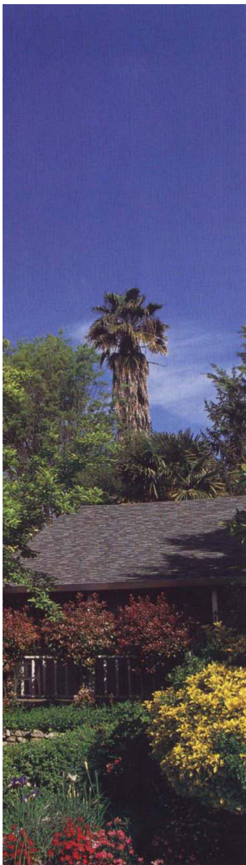
Design and construction of landscapes using trees are among the urban forestry activities that contribute to the economy.

Each monetary transaction involves a buyer and a seller, a purchase and a sale. We focus on the expenditure by major buyers, rather than major sellers, of urban trees and tree-related products and services in 12 months in 1991–1992, 1992, or 1992–1993. We do