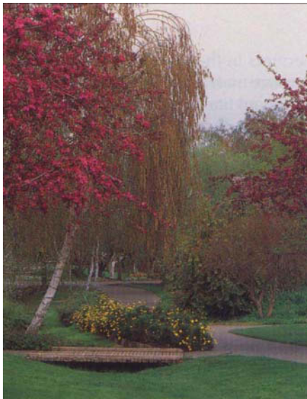
Sales of related products such as fertilizer, pesticides and gardening equipment also contribute to the economy.

so because of the ready availability of data from two important surveys: the National Gardening Association's 1992-1993 survey of households and the California Department of Forestry and Fire Protection's 1992 survey of city and county governments and their community and urban tree programs. Our estimates of expenditures by major buyers are also based on two other sources of information: the 1991