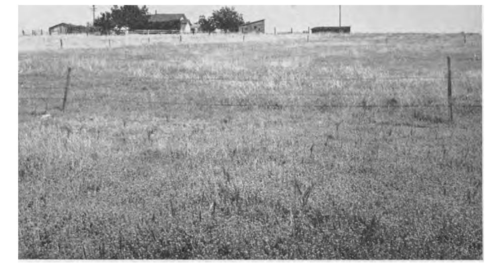
Annual legumes such as this rose clover in Sacramento County, seeded five years ago, serve as the first step in improving low producing range lands.

Sound work in all the ramifications of a range improvement program is essential, but no less important is the willingness to discard prejudices and preconceived ideas.