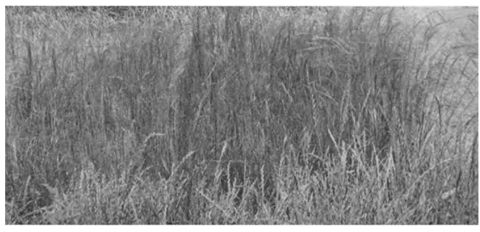
Adaptation trial nursery of range grasses and legumes in San Benito County.

Co-workers have conducted intensive fertilizer tests on cereals, particularly the phosphate-bur clover-cereal cycle.