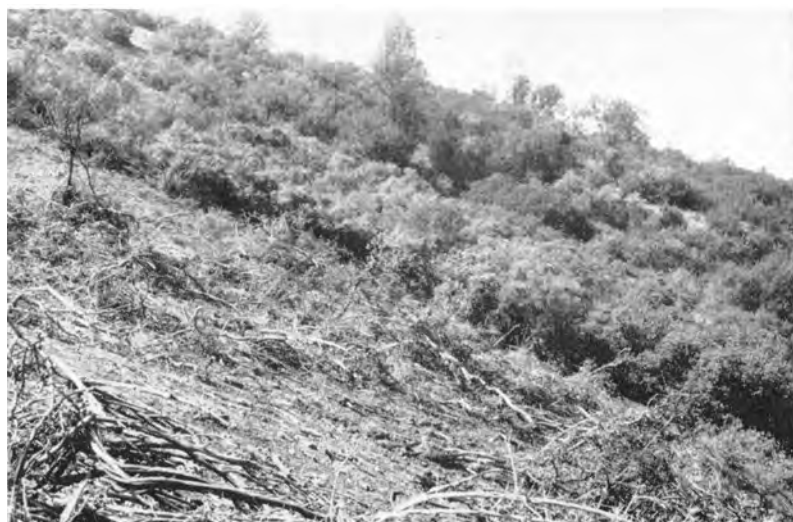
Left. Railed and dried live oak and ceonothus in the foreground before ignition on April 21, 1951. Right. Hot fire in the railed brush when comparable standing brush could not be burned even with flame thrower.

Firing dense brush is dangerous at best. Under no condition should one man