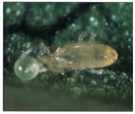
Western orchard predatory mite, Metaseiulus (=Galendromus) occidentalis. Adult female feeding on a Pacific spider mite egg.