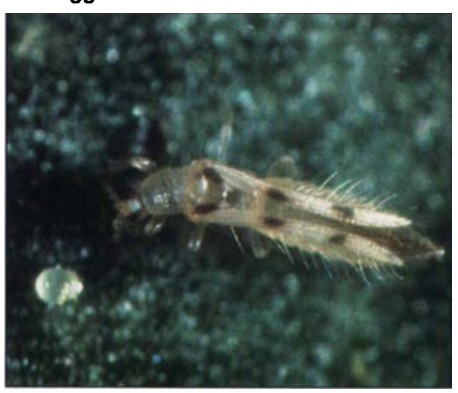
Sixspotted thrips, Scolothrips sexma culatus . Adult female orienting toward a spider mite egg.