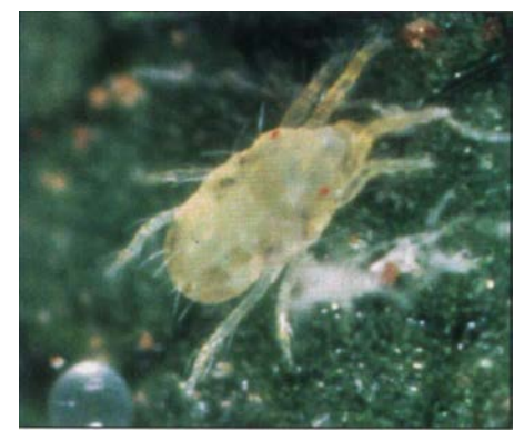
Willamette spider mite, Eotetranychus willamettei , adult female and egg with hairlike papilla.