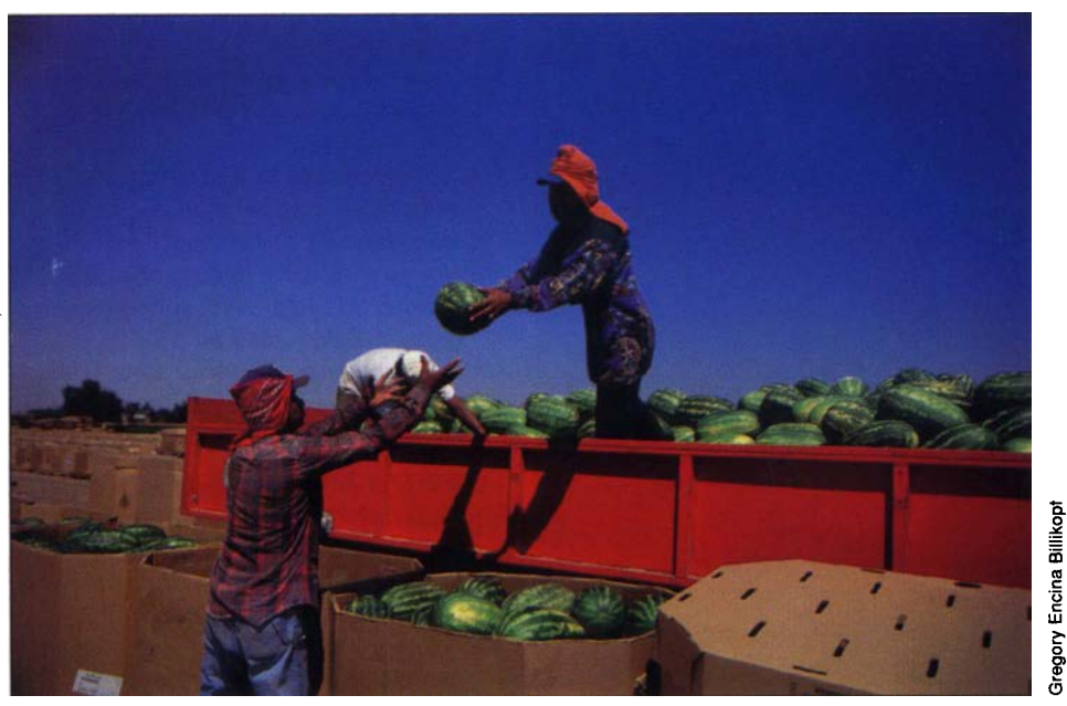
Many crew workers felt growers paid a little better than farm labor contractors.

Yet FLCs have several advantages, including less of a language barrier and the potential for providing longer hours of work beyond those required at any one farm operation. FLCs are likely to improve their image with crew workers if they (1) arrange for smoother transitions between work at one operation and the next; (2) pay workers on a timely basis (regardless of when the FLC gets paid); (3) clearly indicate pay rates ahead of time; (4) make it easy for workers to keep track of what they are earning so that payday discrepancies can be resolved; (5)