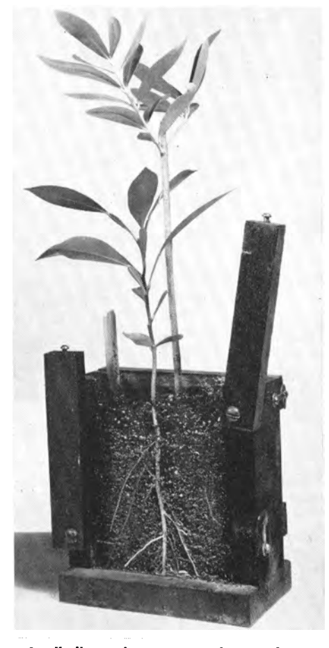
Small olive and orange trees in root-observation box used for inoculations. Side of box has been removed to show orange roots near surface. One-third actual size.

A Mission olive and a Homosassa sweet orange seedling were planted together in