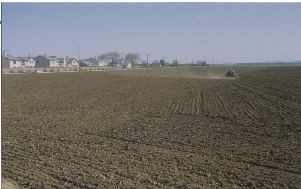
Jack Kelly Clark

As cities expand, urban residents are coming into closer contact with agriculture, as shown here near Modesto.