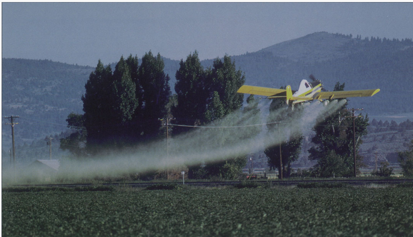
Jack Kelly Clark

As subdivisions spring up around farmland, growers are forced to change their practices, such as curtailing aerial pesticide sprays.