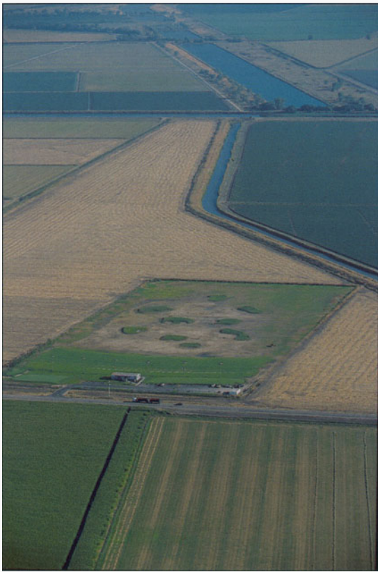
The general plans of most agricultural counties allow nonagricultural uses on farmland, such as this driving range north of Stockton; such uses can create conflicts with adjacent farmers.

be converted to other uses including more urban development.