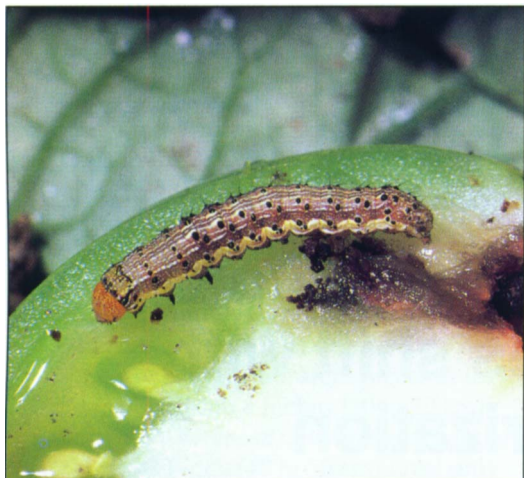
The fruitworm larva is shown on a cross section of a damaged tomato.

tomato growers and PCAs are required to maintain many records that relate to pest management practices. The California Department of Pesticide Regulation (CDPR) requires records of pesticide use, consideration of alternatives, safety training information and environmental considerations. Processors require detailed documentation of pesticide use, and different processor companies have different forms and reporting procedures. Currently all of these requirements involve different forms, documentation and procedures.