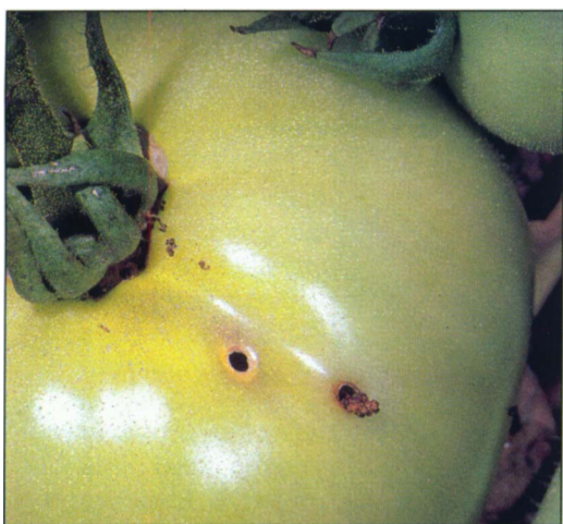
PCAs were more likely to keep records of sampling for worm-damaged fruit than any other UC-recommended sampling method. The frass emerging from one of these holes suggests the damage was caused by tomato fruitworm rather than army-worm.

their pest management programs, especially in future years. Our hope was to be able to suggest some ways to streamline the ever-increasing paperwork required in today's agriculture and to gain insight into the feasibility of various record-keeping procedures. We chose processing tomatoes as an example for several reasons, including the strong interest processors have in pesticide records; the availability of several University of California publications suggesting pest monitoring techniques and record forms; and the willingness of processing tomato growers, PCAs and processors to cooperate in such a study.