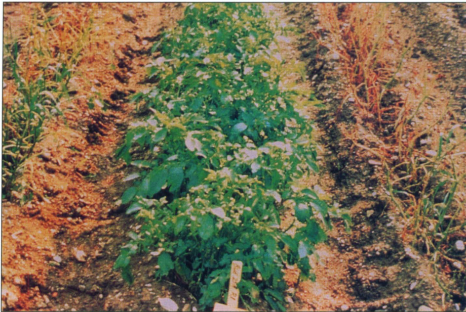
The Bt-transgenic potatoes — in the middle of two rows of nontransgenic potatoes — produce the Cry3A protein, which protects them from damage by the Colorado potato beetle, Leptinotarsa decemlineata .

sects belonging to a wide range of insect orders. Because all Bt proteins have a very restricted spectrum of activity under field conditions, the use of Bt proteins is much more environmentally compatible than the use of chemical insecticides. Bt proteins may persist in the environment, when used in either insecticides or Bt-crops, but their toxic effects on nontarget predators and parasites is low and temporary, being reduced even further after the crop is harvested.