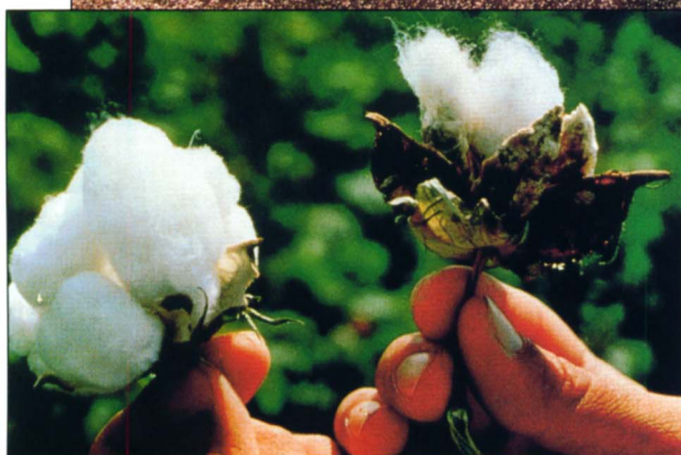
A field of Monsanto's Bollgard cotton with a border of non-transgenic cotton. The Bt-transgenic cotton synthesizes the Cry1Ac protein aimed principally at control of the tobacco budworm, Heliothis virescens , the major cotton pest throughout much of the Southeast. Inset, Bt cotton and cotton from an untreated control plot.

receptors on the surface of the insect's gut. Binding is an essential step of insecticidal action; in susceptible insects the toxicity of a particular Bt protein is correlated with the number of receptors on stomach cells. After binding, it is thought that the toxin molecules insert into the gut membrane and form pores. These pores cause leakage and swelling of the cells due to an influx of positive ions and then water. The swelling continues until the cells lyse, allowing the alkaline gut juices to leak into the insect's blood, raising the blood pH, which causes