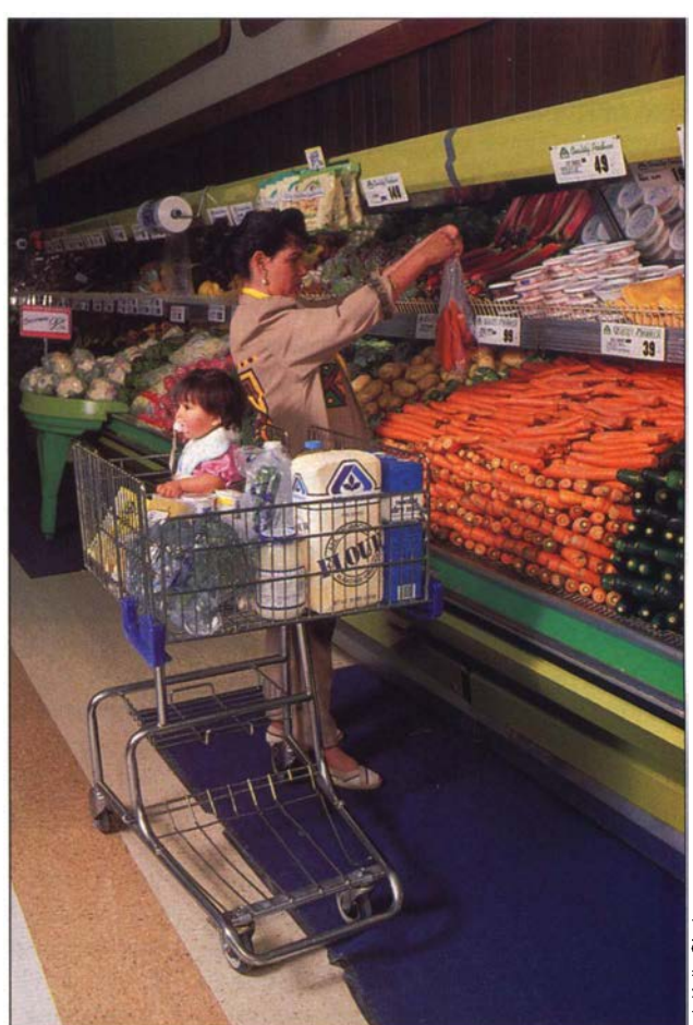
The more-adequately nourished families purchased more fruits and vegetables and were more likely to use a greater variety of cooking methods.