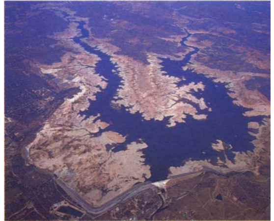
Jack Kelly Clark

HJV: In an era of highly constrained public resources, we must be more systematic and strategic in planning our water research agenda. At present, the creation of water research agendas and priorities is highly decentralized. There are no processes or mechanisms, either formal or informal, for identifying the nation’s water research and development pri-