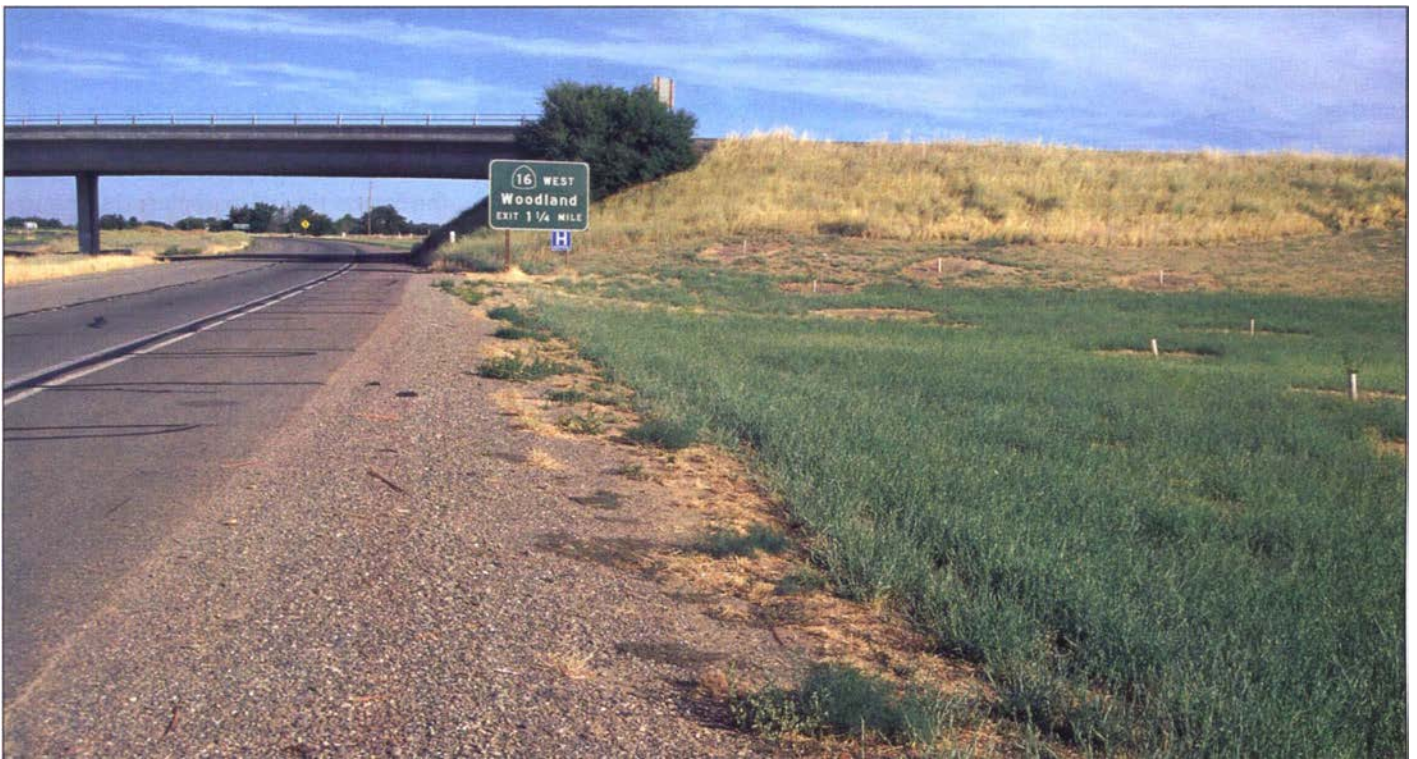
Roadside mowing for fire suppression in late spring can lead to an increase in the yellow starthistle population as seen in the right of this photo.