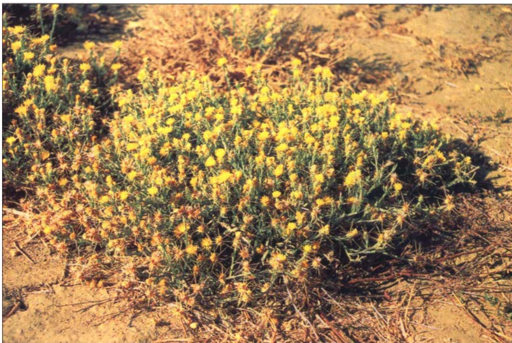
Yellow starthistle with numerous basal branches was mowed three times at early flowering.

Plants mowed at the spiny and flowering growth stages were shorter and produced less biomass and fewer seedheads in comparison to plants mowed at earlier stages (table 1). Multiple mowings further reduced biomass and seedhead production. The greatest reductions in all measured parameters were achieved with two mowings at spiny stage, and one or two mowings at early flowering. Reduction in height was proportional to the reduction in biomass and seedhead production. It is also important to note that mowing late in the season (spiny and early flowering) delayed senescence and allowed plants to continue seed production well into winter.