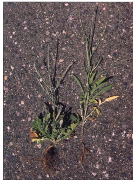
Comparison between yellow starthistle with basal foliage and branching growing in open site and plant with little basal branching and no foliage in grassland area.

C.B. Benefield is Graduate Student, J.M. DiTomaso is Non-Crop Extension Weed Ecologist, and G.B. Kyser is Staff Research Associate, Department of Vegetable