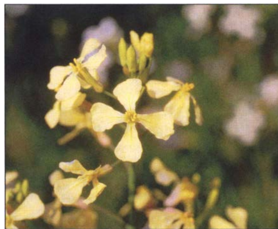
The offspring of caterpillar-attacked wild radish plants had defensive chemicals, which deterred caterpillars from feeding on them.

"We've generally believed that if plants are being hammered by insect pests they won't produce as healthy seeds as would undamaged plants," Agrawal said. "But the results of this study seem to indicate the opposite to be true."