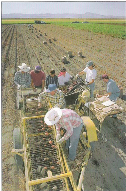
Technology has tended to focus on increasing the productivity of land, not workers.

you implement welfare reform in a place with no jobs" (Arax 1997).