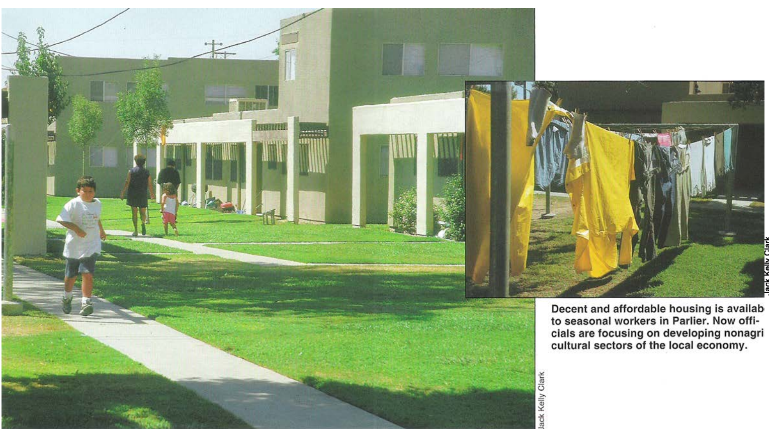
Decent and affordable housing is available to seasonal workers in Parlier. Now officials are focusing on developing nonagricultural sectors of the local economy.