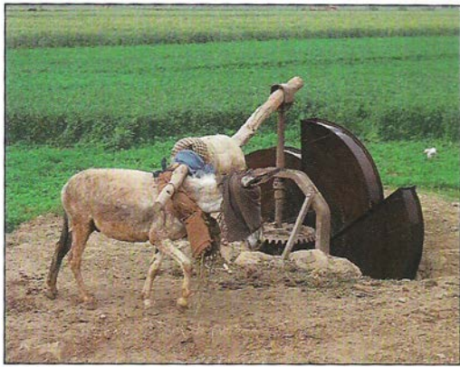
A donkey-driven water pump highlights the timeless nature of Egyptian agriculture.