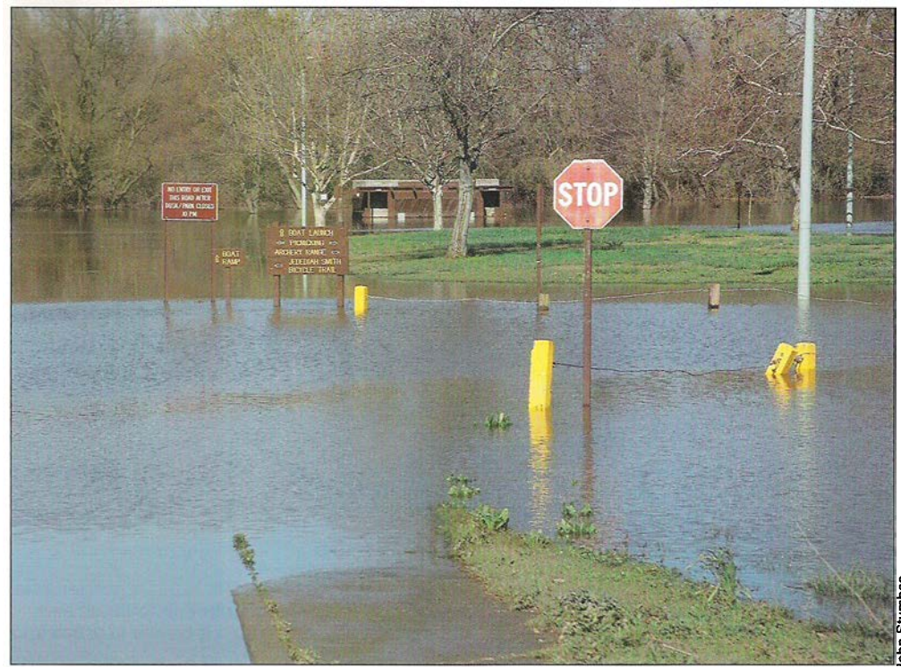
During winter storms, Discovery Park at the confluence of the American and Sacramento rivers frequently floods. Creative and environmentally benign methods are needed to store water in wet years for times of drought.

A flexible irrigated cropping system from which farmers will voluntarily sell water for dry-year urban uses can play this role. The drought water banks of 1991, 1992 and 1994, despite some problems, provided water at costs substantially lower than building new storage dams. This amenity product from agriculture need not disrupt rural communities that depend on agriculture and related services for employment. Agriculture currently uses 75% to 80% of the state's developed water supply, and urban, residential