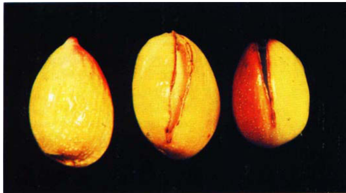
For most pistachio nuts, the hull remains intact until after harvest, left , whereas a small percentage of nuts rupture their hulls either by cracking, middle , or splitting along the shell suture, which is characteristic of early-split nuts, right .

in water applied (about 16 inches less than the control) but only a relatively small difference in the incidence of early-split nuts (table 2).