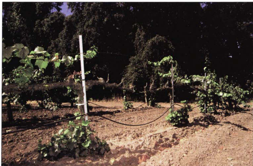
As the infection spreads, the top of the vine dies while scion or rootstock suckers sprout from near the soil level. Grape growers throughout California should be especially watchful of vineyards located near citrus groves, or near other possible, noncitrus glassy-winged sharpshooter hosts.

ease related to other factors, such as proximity to other GWSS or Pierce's disease hosts, soil condition, irrigation or fertilizer. For example, two vineyards (sites 2 and 3) had higher disease incidences in the middle blocks (table 2), suggesting that variables other than citrus proximity influenced the expression of Pierce's disease symptoms.