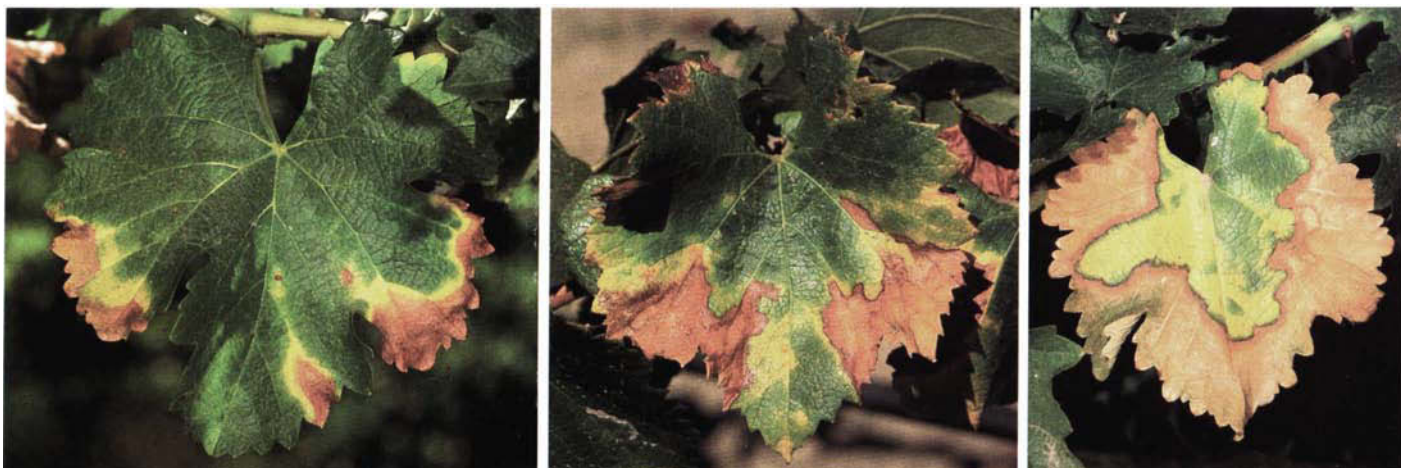
X. fastidiosa reproduces and plugs water-conducting tissues, causing water stress and killing the plant. In late summer and fall, grape foliage (white variety) infected with Pierce's disease becomes slightly yellow at the margins and then dies, leaving concentric zones of progressive discoloration.

Temecula include leaf marginal necrosis, early drying of the fruit ("raisining"), and "green islands," which are areas of abnormally green bark surrounded by mature brown bark on the canes.