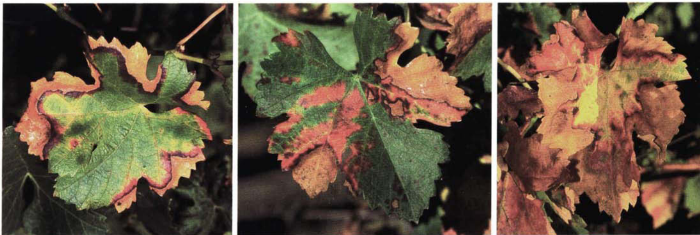
In a red grape variety infected with Pierce's disease, leaf margins become slightly red and die.

blocks the R-square values were quite low, ranging from near zero to 0.12. The R-square, or the coefficient of determination, measures the proportion of variation in the data that can be explained by some variable, in this case distance from citrus. The low R-square indicates that no more than 12% of the variation in distribution of Pierce's disease within individual blocks can be attributed to distance from citrus. These analyses highlight the limitation of using small blocks to evaluate the spatial distribution of Pierce's disease spread by GWSS.