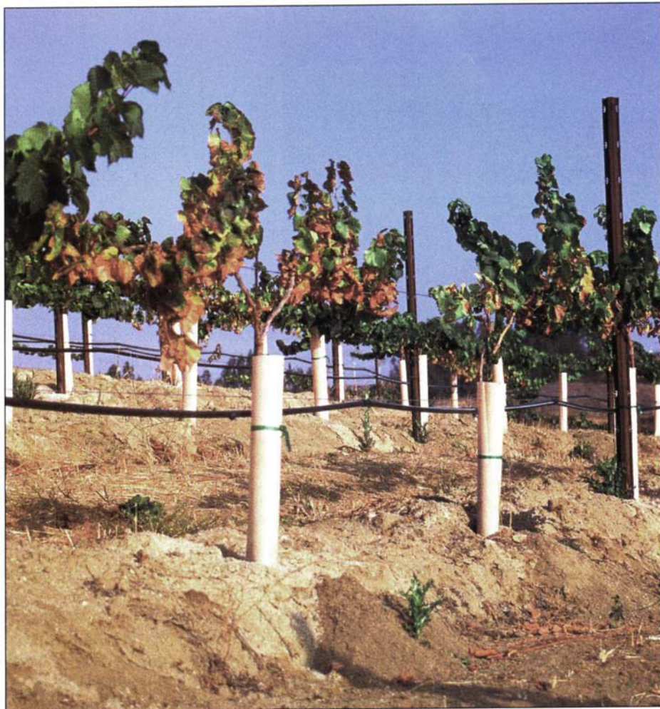
Phil A. Phillips

Pierce's disease symptoms were rated for every vine in each block on a scale of 0, 1, 2, 3 or 4, representing healthy, 25%, 50%, 75% and 100% of the vine showing Pierce's disease, respectively. The differences in ratings were not qualitative, but quantitative, that is, the proportion of the plant showing symptoms. Symptoms of Pierce's disease in the late summer in