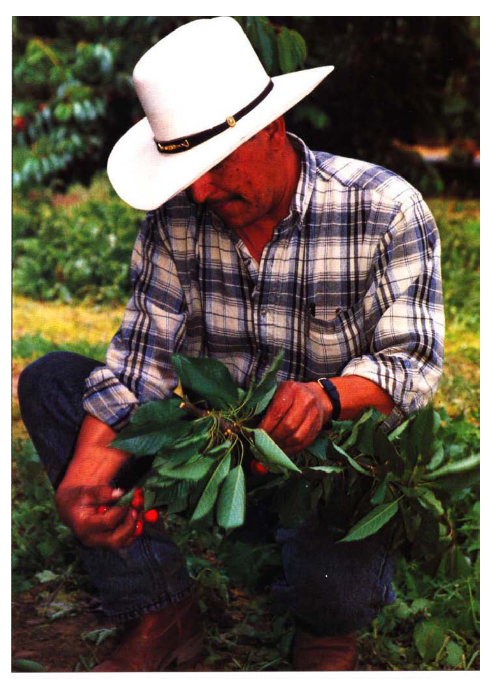
When identifying the most challenging and rewarding aspects of their positions, farm supervisors overwhelmingly selected their relations with people.

Those in upper management were six times more likely to fire an employee (85%) than first-line supervisors (14%). Respondents recalled having fired the last person as long as 44 years ago and as recently as 2 weeks ago, with an average of a little over 10 years since the last termination. Considering that the average time working as a supervisor was 14 years, it is clear that farm employees are not often terminated. In several instances the distinction between the employees being fired or quitting was blurred, as was the distinction between being fired or simply not rehired the next season. With the exception of two instances,