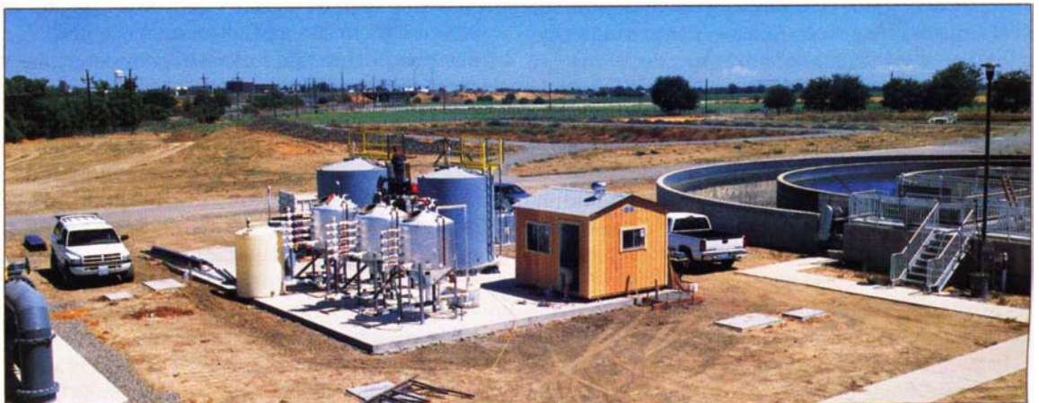
At UC Davis, a pilot plant is under construction of the APS-Digester, which converts animal manure and plant waste into biogas under anaerobic conditions. The first commercial application will be at a Florida racetrack, but it has broad applications for dairy, swine, poultry and other animal operations.