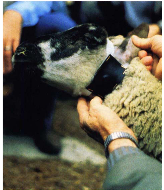
The livestock protection collar is attached to the necks of vulnerable sheep. If the coyote punctures the collar while attacking the sheep, it receives a lethal dose of sodium fluoroacetate. This method can selectively control sheep-killing coyotes, but it was banned by California voters in 1998.

While relying on LPCs, coyote sightings and field signs indicated an