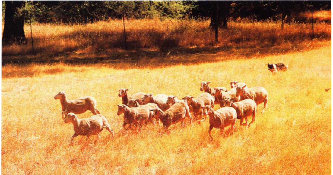
During a recent field day, a border collie herded sheep, above. A variety of methods were tested to control sheep-killing coyotes, including electric fences, and guard animals such as llamas and dogs. None were particularly effective, and the llamas sometimes turned on the border collies.

Unfortunately, passage of the 1998 antitrapping initiative banned all uses of sodium fluoroacetate, including its use in the LPC. It also banned sodium cyanide, which was used in M-44 spring-loaded ejector devices; M-44s are set in the ground and expel quick-acting poison into the mouths of animals that tug at their bait. Both chemicals, now banned, were used in California only by government personnel. Proposition 4 also banned leg-hold traps, including padded traps, with no exemptions for research. We believe passage of this measure banned predator management tools with a history of safe and effective use. It also made capture of coyotes for research purposes more difficult.