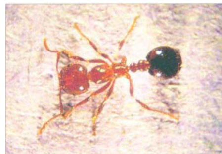
Texas A&M University

Although the U.S. Department of Agriculture and California Department of Food and Agriculture (CDFA) have maintained quarantines regulating the movement of soil, hay and equipment from regions inhabited by red imported fire ants, over the last 15 years they have been intercepted on numerous occasions at California border stations, and periodic outbreaks have occurred in several counties. The ants arrived on trucks, trains or other vehicles. In 1997, they were identified on bee shipments from Texas destined for almond orchards in the San