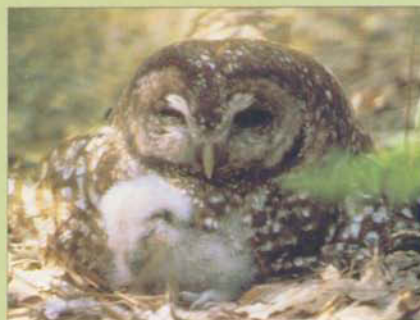
Spotted owl chick

Red imported fire ants disrupt ecosystems and endanger wildlife by preying on other insects; eating mammal, reptilian and bird newborns, and soft-shelled eggs; destroying habitat; and reducing food sources. The following endangered species could be at even greater risk if the ants become widely established in California.