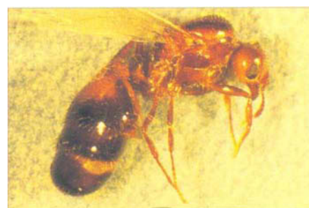
Lloyd Davis, Jr.

The ants are also known to cause extensive damage to irrigation lines. For unknown reasons, they aggregate near electrical fields where they can cause short circuits or interfere with switches and mechanical equipment such as water pumps, computers and air conditioners. Even more serious is when they infest traffic signals and airport landing lights. They also reduce biodiversity and threaten endangered species. Other species of ants, invertebrates and vertebrates are eliminated when they compete with red imported fire ants for limited resources.