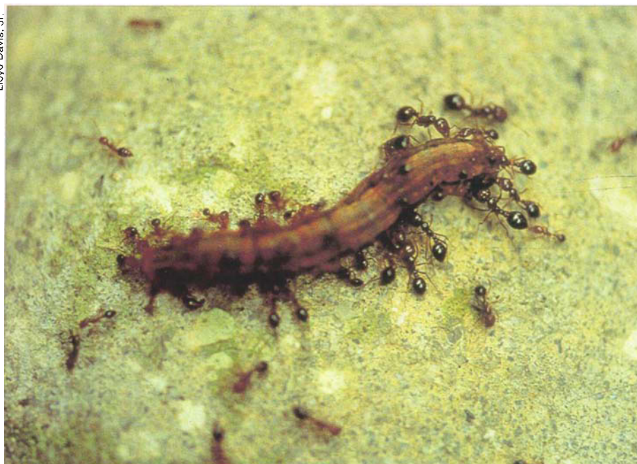
Red imported fire ants will attack both adult and larval insects such as the armyworm, left , on the ground or on plants. As such, they can have the positive effect of controlling agricultural pests such as the cotton bollworm. However, they also attack beneficial insects.

open nursery acreage that produces container plants would be affected by quarantine regulations. Based on the 1997 Census of Agriculture, 28,000 acres in California were devoted to open field nursery production of bedding and flower plants, foliage, potted flowers and other nursery stock (USDA 1999). Because all nurseries within quarantined regions — whether infested or not — must treat in order to ship outside of the quarantine, almost all nurseries would be affected by the regulations. Therefore, we estimated total costs to the nursery industry on all open field acreage to be $18.2 million. In addition, nurseries would be required to be inspected for the ants by placing bait out quarterly. Additional costs for inspection and certification are about $1.40 per acre.