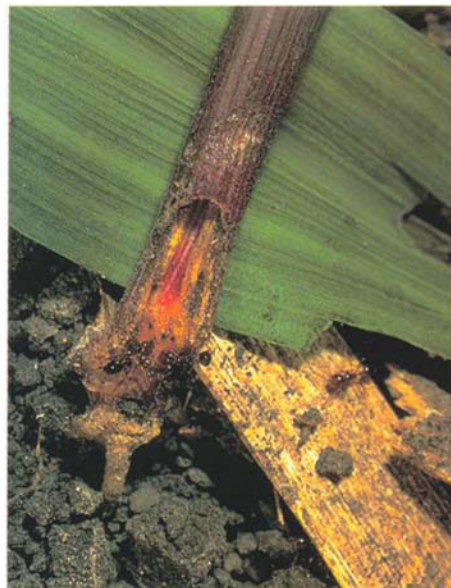
Red imported fire ants are notoriously difficult to eradicate. In Texas, county extension agent Glenn Avriett, left, treats a mound with the insecticide acephate. Ants can damage crops like corn, right, but most pesticide treatments would be undertaken to protect farmworkers, agricultural and electrical equipment, and irrigation systems.

less the probability of success for the first 5-year period program times the costs for the second. The expected benefits are equal to the probability of success for the first period times the total benefits plus the probability of failure for the first period times the probability of success for the second times the benefits. The probability of success during the second 5-year funding period is unknown. Consequently, the cost/benefit analysis estimates the probability of success that is needed for the expected benefits to be equal to the expected costs (table 4).