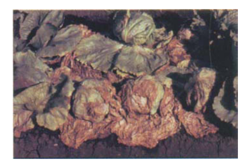
Scientists have found a higher incidence of lettuce drop disease ( Sclerotinia minor ) with subsurface drip irrigation and related tillage practices.

An on-farm trial was established in September 1995 near Chualar, in the Salinas Valley. The soil was a Cropley