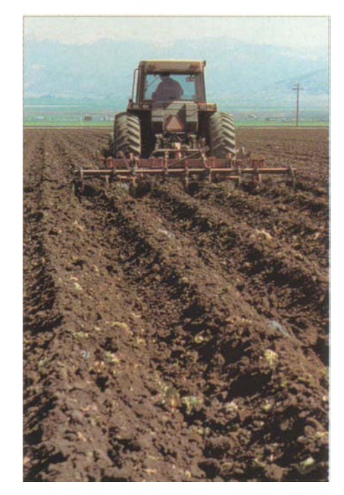
In a 3-year study, intermittent deep chiseling and ripping resulted in higher fresh lettuce yield and fewer symptoms of lettuce drop disease. A minimum-till ripper in the field undertakes the last step of the four-step deep minimum tillage program.

The field was managed uniformly with inorganic fertilizers and sprinkler and furrow irrigation. From 1996 through 1999, one broccoli and one crisphead lettuce crop were produced each year. A cover crop of was grown in the fall of 1998. The lettuce cultivar was Sharpshooter in 1997 and 1998, and Venus in 1999. Bulk density and