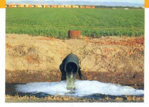
Irrigation tail water, above , may contain pollutants such as pesticide residues, sediment, nutrients and salt. Research by UC scientists describes how insecticide choice in alfalfa may affect aquatic life.