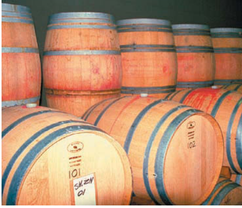
Grape production was up 12.5% in 2002, but prices received by growers were 17% lower.