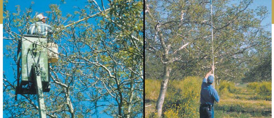
To test the effectiveness of mating disruption in controlling codling moth, pheromone dispensers were applied to walnut trees in the northern San Joaquin Valley. The dispensers must be hung by hand either from a pruning tower, left , or the ground, right .

The Community Alliance with Fam-I ily Farmers (CAFF), through its innovative Biologically Integrated Orchard Systems (BIOS) project in Yolo and Solano counties, demonstrated from 1996 to 1999 that it is possible to reduce pesticide use and still produce good yields of high-quality walnuts with low levels of pest damage (CAFF 1999). BIOS emphasizes intensive monitoring, biological control and beneficial insect habitat enhancement to control pests; cover crops, animal manures and composts to build soil; and measured use of fertilizers based on nutrient budgeting and leaf tissue anal-