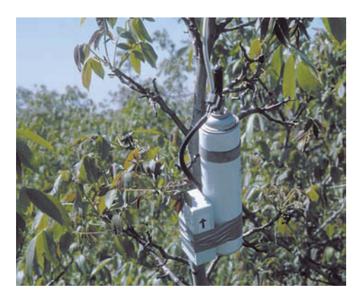
Pheromones can be applied in aerosol form, such as this experimental microsprayer, or "puffer," which releases precise doses at timed intervals.

* Use of mating disruption is indicated by colored numerals