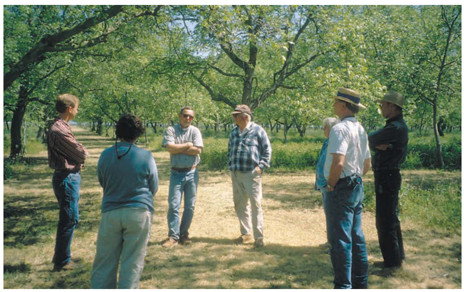
The BIOS implementation team, consisting of growers, UC advisors and technical experts, visited with growers at the beginning of the project to suggest strategies for reducing pesticide use.

prevailed in orchards where this material was used in 1999, the longevity of the emulsion was such that two applications were sufficient for the season. Three applications were needed in 2000. This material provided good control of nut damage during the season and at harvest.