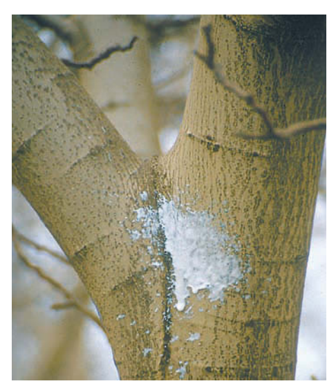
A variety of pheromone mating-disruption products were tested in BIOS and conventional orchards, including a recently developed wax emulsion applied using a pressurized handgun that projects the emulsion near the tops of trees.

A recently developed experimental wax emulsion containing codling moth pheromone (Atterholt et al. 1999; Grant et al. 2001) was made available to our project by the manufacturer (Gowan). We used the product in four BIOS blocks (B, E, F and G) in 1999 and three (B, H and L) in 2000. The pheromone emulsion was applied using a pressurized handgun applicator that projected a precisely metered stream of emulsion onto branches or leaves near the tops of trees. The application rate and concentration were designed to provide