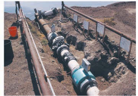
Several different types of flow meters were tested for accuracy and ease of use in dairy manure ponds. Left , The Doppler meter sensor is attached to the side of a PVC pipe. Above , A tube electromagnetic flow meter is installed in a PVC pipe. Top right , Insertable electromagnetic flow meters were accurate in tests; they are most useful if the meter needs to be moved from site to site. Right , The flow meters were tested in series. Dairies may realize significant savings in fertilizer costs by investing in a Doppler or electromagnetic flow meter.

because manure solids and debris in the water collect and clog many flow meters. The propeller meter, widely used for measuring flow rates in other agricultural applications, is also susceptible to weeds and twine entangling the propeller. In fact, any flow meter that extends into the flow path of the pipeline is likely to experience the same problems. Alternative methods of estimating manure-water flow rates, such as measuring the rate of drop in the manure pond or estimating flow rates from assumed pump discharge, have their drawbacks. Pond drop measurements are complicated by the difficulty in determining the actual surface level of the pond and by inflows potentially occurring at the same time as discharges. The discharge rate of some manure-water pumps, such as floating agitator pumps, may vary widely depending on the level of the manure pond. As a belowground pond is emptied, the pump discharge rate drops. The pumping rate of one manure-pond pump dropped from 1,200 to 800 gallons per minute (gpm) when the pond surface fell approximately 5 feet.