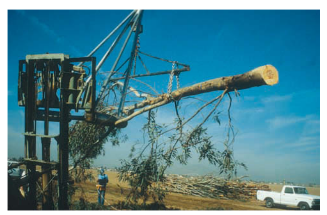
Finally, trees were weighed with a forklift and crane scale. The authors found that river red gum trees did best when irrigated with at least 4 acre-feet of water per year and at about 900 trees per acre; fertilizer did not have an effect.