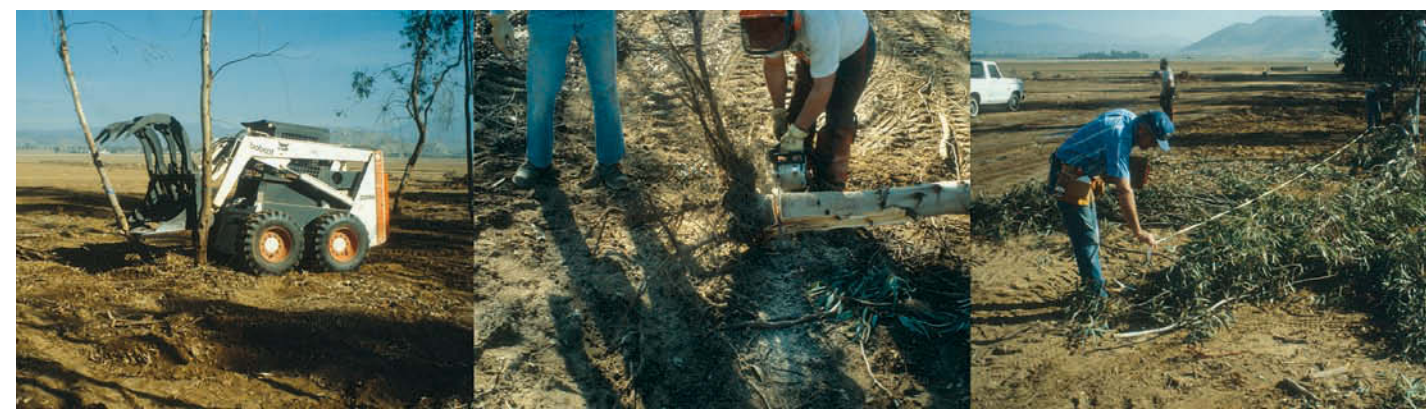
Left, record trees were pushed over and pulled up with a skid steer loader, then, center, the trunks were cut just above the root mass