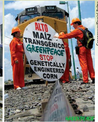
Left, genetically engineered seed and crops are subject to stricter handling, transporting and tracking procedures to prevent cross-pollination and adventitious (accidental) mixing with conventional crops. The presence of Starlink corn in food products showed that there were weaknesses in the ability to segregate grains on their way to market. Right, in August 2003, Greenpeace activists blocked a trainload of biotech corn as it attempted to cross the Rio Grande into Mexico, claiming that it threatened native land races of maize.

allele in each vegetable), would do much to encourage further development of such products.