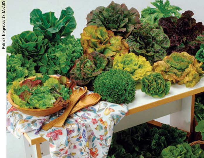
There are often dozens of varieties for a particular horticultural crop. Above, seeds of the world's most unusual lettuces are safeguarded in an ARS gene bank in Salinas. Genetically engineered lettuce has not been commercialized.

mixing with other varieties. Such mixing can occur as a result of pollen movement from a biotech field to a conventional field or during seed harvest and cleaning. Adventitious mixing occurs when very small amounts of biotech seed mix with other nonbiotech seed. Regulatory agencies in some countries establish "tolerances," the maximum allowable amount of adventitious material (similar to tolerances for pesticide residues). For biotech varieties at the experimental stage (unapproved events), the tolerances are usually zero in food and seed. For biotech varieties approved for commercial growing and consumption, the thresholds for adventitious presence vary from country to country, ranging from less than 1% to 5% for food ingredients, and 0.3% to 1% for seed. By comparison, conventional seed-purity thresholds are usually between 1% and 10%, depending on the crop and varieties.