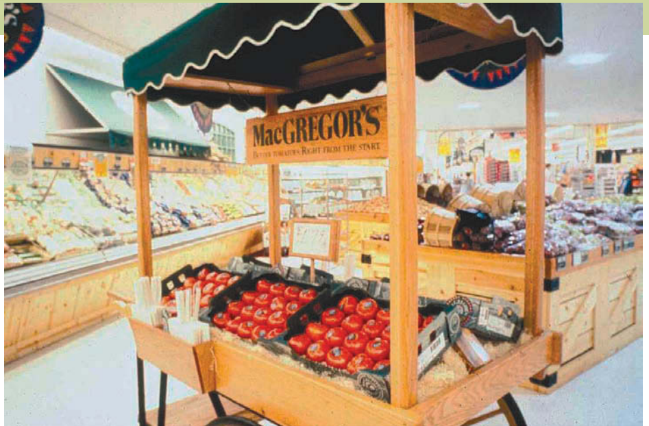
Calgene's Flavr Savr tomato was successfully sold under the MacGregor's brand in the United States. Consumers were willing to purchase it, but the product was not financially profitable and was ultimately withdrawn from the market.

Horticultural crops were the first biotech crops commercialized in the United States, beginning with Calgene's ground-breaking Flavr Savr tomato in 1994, followed in 1995 by Asgrow's virus-resistant squash and DNA Plant Technology's Endless Summer tomato. The Flavr Savr tomato, with its superior flavor and shelf life, was well received by consumers, garnered repeat purchases and demonstrated that consumers were receptive to fresh produce labeled as genetically engineered (Bruning and Lyons 2000). In 1996, Zeneca launched a biotech processing-tomato product that from 1999 to 2000 was the best-selling tomato paste (puree) in the United Kingdom. The paste reduced processing costs and resulted in a 20% lower price. However,