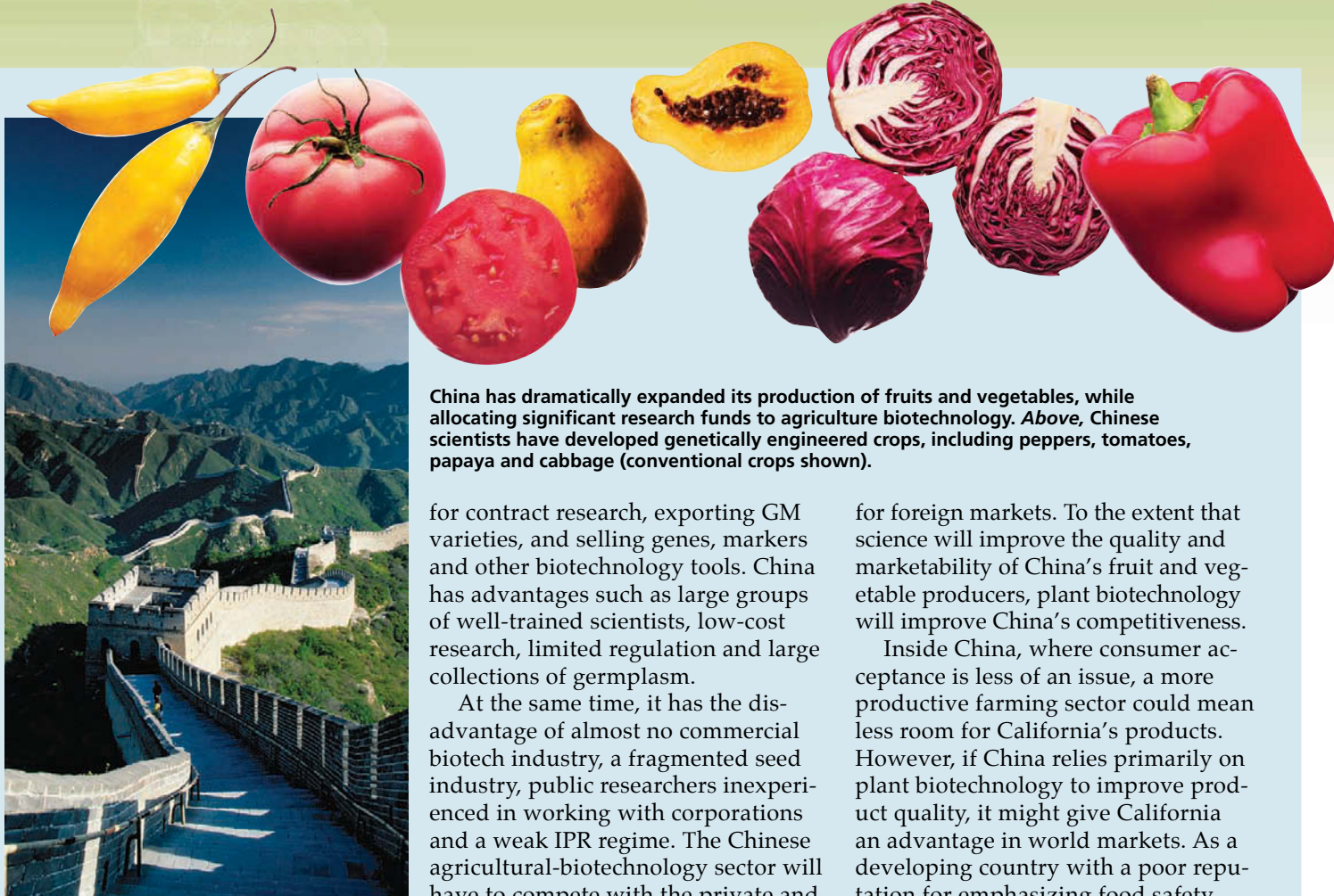
China has dramatically expanded its production of fruits and vegetables, while allocating significant research funds to agriculture biotechnology. Above, Chinese scientists have developed genetically engineered crops, including peppers, tomatoes, papaya and cabbage (conventional crops shown).

Chinese consumers would react if they knew that their food was produced with GM varieties, although recent research suggests a relatively high degree of acceptance.