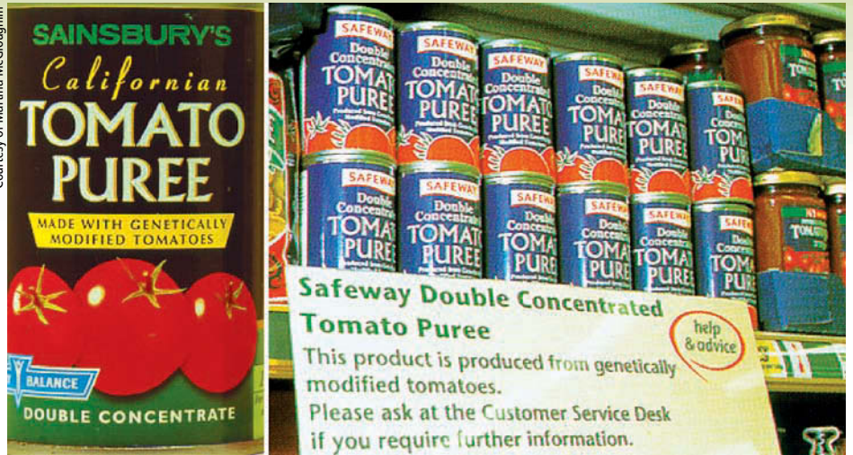
Zeneca's biotech tomato puree (paste) was successfully sold in the United Kingdom from 1996 to 2000.

approvals (see box, page 109). No case has been documented to date of harm to humans or the environment from the biotech crops currently being marketed, although "genetic drift" from transgenic to conventional crops has occurred as it has for millennia between conventional crops. Now some Mexican growers have expressed concerns under the North American Free Trade Agreement (NAFTA) about preserving the biodiversity of their maize due to gene flow from transgenic corn (NACEC 2004).