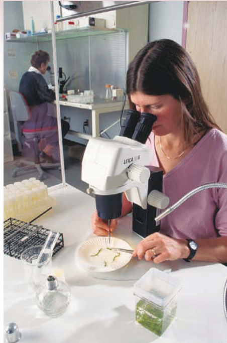
The time and effort involved in negotiating public-private research partnerships is substantial, but such arrangements can be fruitful for both parties. Above, a UC scientist uses tissue culture to propagate grapes in the laboratory.

utilize public research and universities can secure access to research funding and cutting-edge enabling technologies. These collaborations can serve as stepping-stones to more formal, long-term agreements. Alternatively, once initial consortia-university research partnerships are established, more enterprising members of the consortia can capitalize on the research contacts and pursue firm-specific, applied-research partnerships.