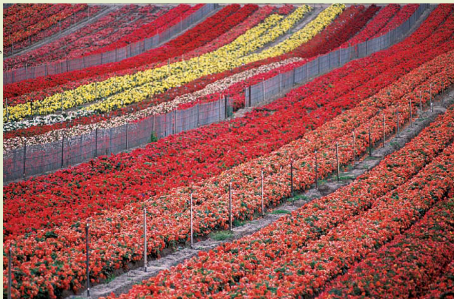
With regard to horticultural crops, consumer preferences vary. They may want several different melon varieties or flower colors, left . Garden and lawn-care products such as turfgrass, right , could provide inroads for genetically engineered varieties.