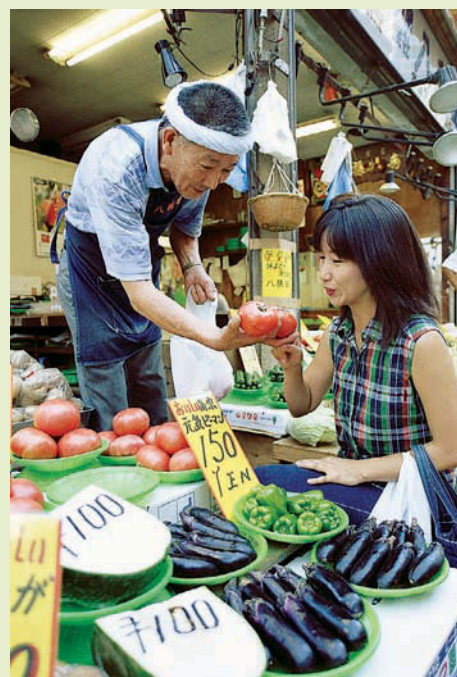
Global consumption of fruits and vegetables is on the rise, but important markets for California produce growers such as Europe and Japan, above, have taken a cautious approach toward imports of transgenic foods.

Integration among international traders and grower-shippers allows them to position themselves as consistent year-round suppliers of differentiated products; these firms increasingly seek out varieties that offer superior