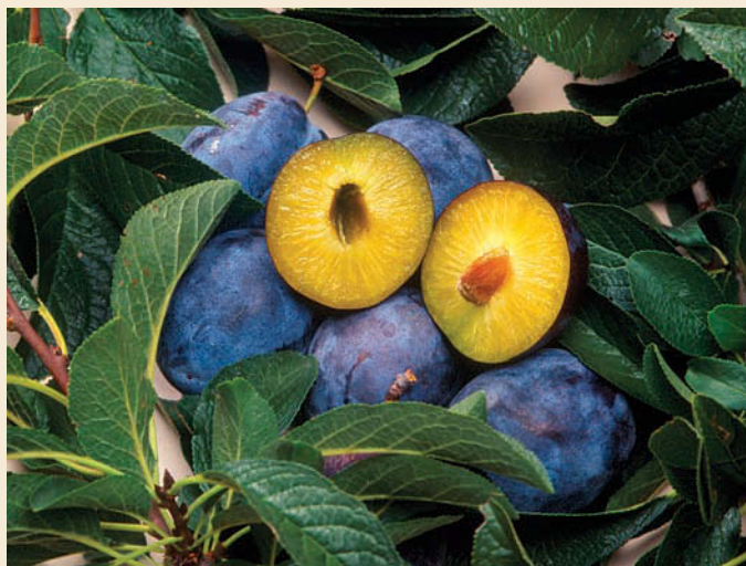
Plums resistant to the plum pox virus have been developed by scientists with the U.S. Department of Agriculture but are not yet available to growers.

Crops currently being tested. Numerous fruits and vegetables have been transformed through genetic engineering and are being tested for their potential role in improving pest management. For example, University of Florida researchers are testing virus-resistant tomatoes as a substitute for the extensive insecticide spraying currently utilized to control insects vectoring geminiviruses. In California, herbicide-tolerant processing tomatoes have been tested and have the potential to reduce grower costs by