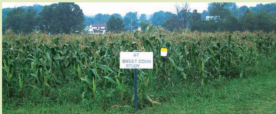
Results from a consumer-preference study in central Pennsylvania suggest that there may be a viable market for Bt sweet corn, above.