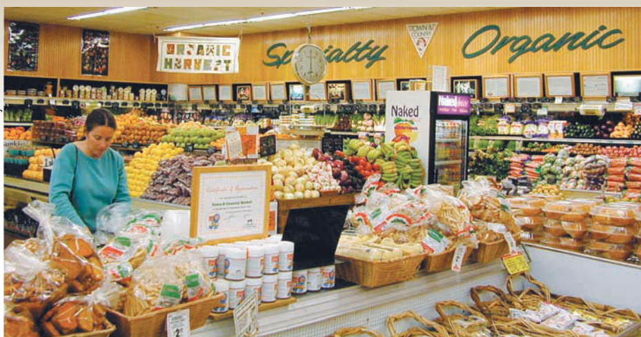
Consumers can avoid biotech ingredients by purchasing certified organic produce and foods, which cannot be grown using biotech crops. It is difficult to determine how important the absence of biotech ingredients is to consumers relative to other components of organic certification.

from experimental auctions, which incorporate purchases, have been shown to more closely approximate how consumers would behave in a market environment. In one type of auction, participants are brought to a common location, given some money and asked to bid on a product. After bids are collected, the "winning" bidders are determined, and they use the money received earlier to purchase the product being auctioned.