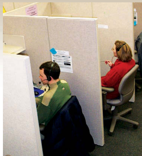
Individual consumer surveys are subject to interpretation, but together they tell a fairly consistent story about attitudes and knowledge of agricultural biotechnology. Above, surveyors question consumers.

Many surveys ask respondents to rate the extent of their knowledge or familiarity with biotechnology or genetic engineering. Two studies conducted in 1998 and 2000 found that only about 20% of respondents said they knew or understood "some" or "a lot" about GM foods (Shanahan et al. 2001). Between 1997 and 2002, several consumer surveys were conducted