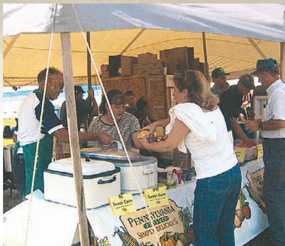
At Pennsylvania State University's Ag Progress Days, Bt sweet corn was offered to consumers alongside corn labeled as "IPM" (grown using integrated pest management), along with informational brochures.

know, are there any foods produced through biotechnology in the supermarket now?" Over the years, "Yes" responses ranged from 33% to 43%. Although this proportion may seem low, given that roughly two-thirds of the items available at food retailers contain GE ingredients, 33% is a fairly high proportion for this type of question relative to other studies (perhaps because of the use of "biotechnology," which refers to a broader range of practices relative to "genetic engineering"). In the 2001 Pew study, only 19% said they had eaten GM foods, 62% said they had not and 19% did not know. When asked how many foods in a typical American grocery store they thought were genetically modified, only 14% of the 2001 Pew respondents thought that over half of the foods contained such ingredients.