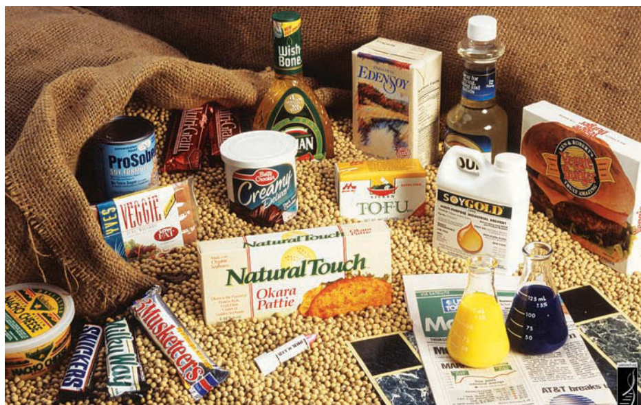
Because genetically engineered cottonseed, canola, corn and soy are common in many processed foods, the percentage of foods in the supermarket with at least one of these ingredients is estimated as high as 75%. But in surveys, many consumers are unaware that they have been eating foods with genetically engineered ingredients.

Other questions ask whether respondents have ever eaten a biotech product, or whether biotech products are available in grocery stores now. The IFIC studies conducted between 1997 and 2003 each asked "as far as you