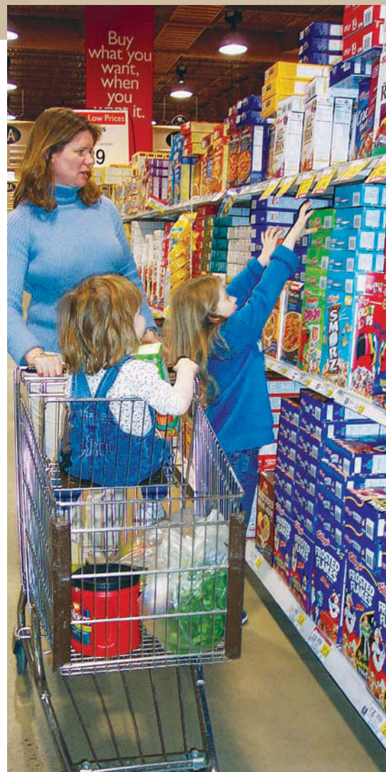
Consumer preferences could play an important role in the future of agricultural biotechnology in the United States.

While market data is not available, a fairly extensive body of survey research has been conducted to assess consumer awareness and knowledge of, and attitudes toward biotech products. Stated attitudes are usually used to infer how consumers might respond to, for in-