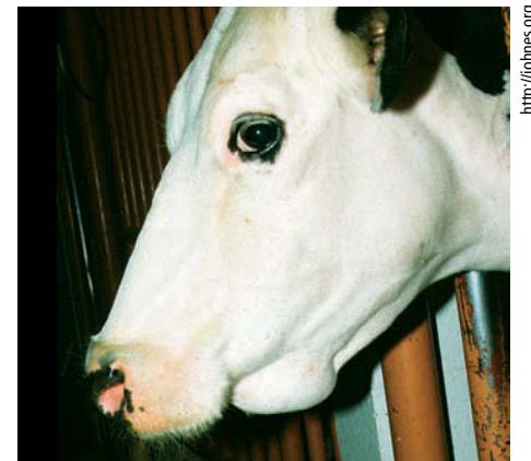
"Bottle jaw," also called submandibular edema, is another sign of Johne's disease. A UC Cooperative Extension short course teaches dairy operators the clinical signs of Johne's disease, as well as how to prevent it.