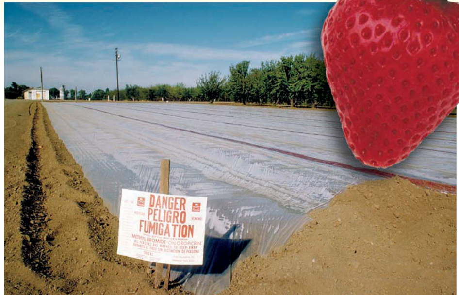
Jack Kelly Clark

The DPR's use regulations are administered through a permit process. In order to apply a restricted-use pesticide,