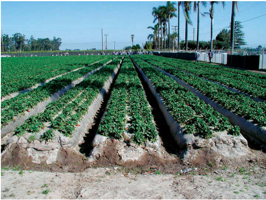
After the methyl bromide rules were implemented, growers reported increased costs and lost income due to lower yields on untreated acreage, reduced sales to the freezer market, and additional labor, equipment and notification costs.

prior to bed construction. The scientific studies consulted by the DPR indicated that bed fumigation had a much larger emissions ratio than flat fumigation, so that human exposure to methyl bromide was much greater given the amount of methyl bromide applied. In order to provide the same protection for human health, larger buffer zones were required for bed fumigation. Due to the larger buffer zones and the associated loss of fumigated acreage, some growers found it preferable to switch to flat fumigation. Flat fumigation is much more expensive, however, at least an estimated $1,000 per acre more than bed fumigation. This regulation benefited pesticide applicators, because most growers did not have the equipment necessary for flat fumigation and had to hire custom applicators.