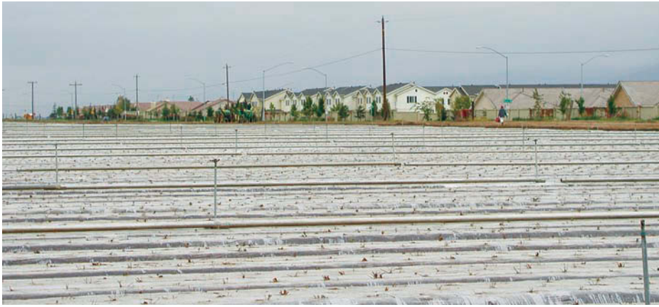
Near Salinas, strawberry fields are directly adjacent to residential areas. If growers choose not to farm at the rural-urban interface due to regulatory concerns, such agricultural lands could be at greater risk of conversion to residential or commercial uses.

was reduced from 50 to 30 feet for very low emissions per acre and relatively small application blocks.