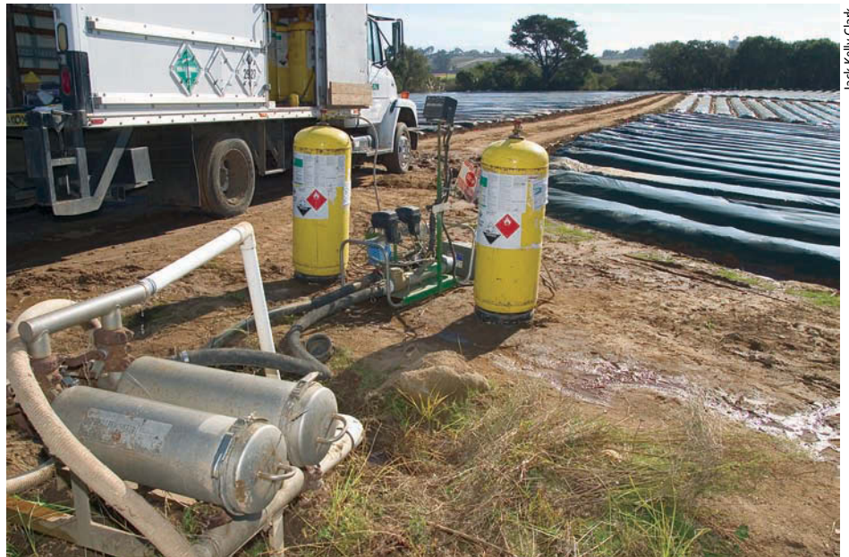
Jack Kelly Clark

The DPR methyl bromide use restrictions imposed in 2001 were complex. Two types of buffer zones were specified: an inner buffer zone and an outer buffer zone. The size of each buffer zone depended on such factors as the size of the application block (acreage fumigated in a 24-hour period), the application rate, the method of application, the proximity of the field to houses or other occupied buildings, and the willingness of neighbors to allow the fumigation to proceed. For both types of buffer zones, the operator had to obtain permission from the neighboring landowner to extend the buffer zone onto the adjacent property.