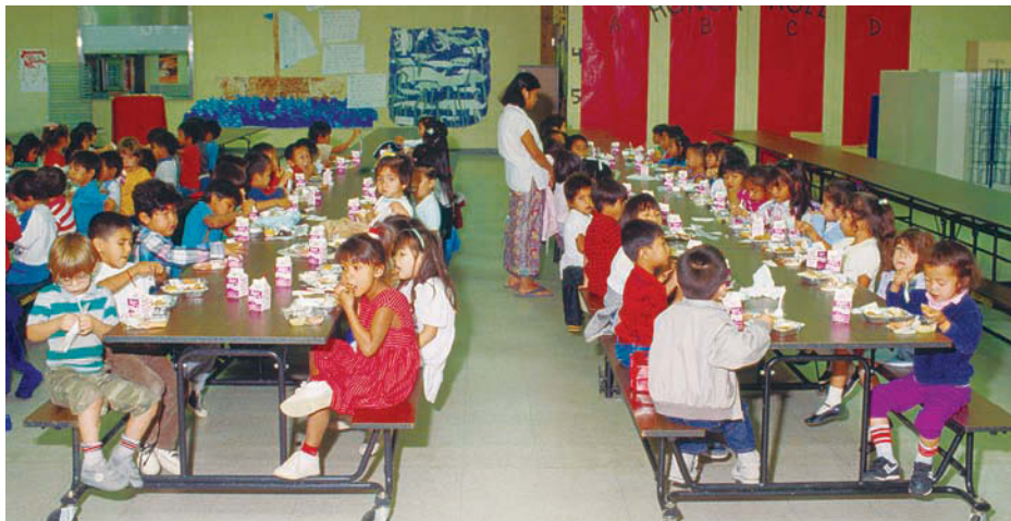
The Food Quality Protection Act reflects findings of a 1993 National Research Council report, Pesticides in the Diets of Infants and Children . The law requires an additional 10-fold safety factor on some pesticide tolerances to provide additional protection for young people.

less than 300,000 acres in production, which the EPA administrator determines do not provide sufficient economic incentive to support registration and for which there are no effective pesticide alternatives, or uses for which the available alternatives pose greater human risks. A pesticide can also receive minor-use status if it significantly aids in resistance management or improves IPM systems. The incentives may include an additional year of exclusive data use, waivers of certain data requirements and expeditious review that could bring the product to market sooner.