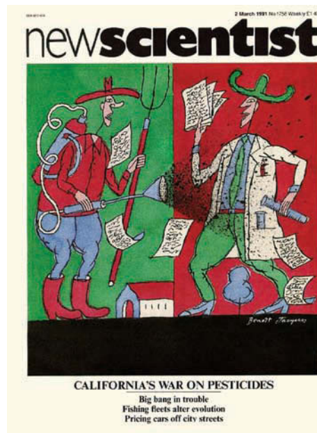
Pesticide regulation has long been controversial in California (March 1991 cover shown).

The OP insecticides bind to the enzyme acetylcholinesterase in the central and peripheral nervous system. This deactivates the acetylcholinesterase, resulting in repeated, uncontrolled stimulation (firing) at the nerve junctions. The EPA has tentatively considered the OP insecticides to act through a common mechanism of toxicity. While dietary exposure to a particular OP may be low, the simultaneous exposure to multiple OP insecticides may result in some segments of the population exceeding acceptable daily allowances (Byrd 1997). The implementation and ramifications of the OP insecticides having a common mode of toxicity has not been clarified at this point.