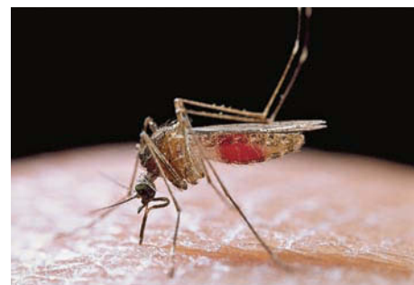
UC mosquito research was conducted in Fresno throughout the 1970s; the lab moved to Kearney in early 1984.

environment. In other areas, they witnessed the phenomena of biological control when, without any pesticide treatment, a pest population would spontaneously disappear. Scientific evaluation revealed natural pest predators at work. In the 1950s, the campus-based scientists, researchers in the valley, farm advisors and specialists began making connections. They studied the concepts of “integrated control” and “economic thresholds” and soon, just as research at Kearney was hitting its stride, “integrated pest management” was born.