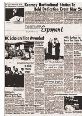
May 10, 1965, Reedley Exponent announces dedication.

What started 40 years ago as an old ranch at the heart of the San Joaquin Valley is today a world-class research operation, from which flows a steady stream of practical ideas and solutions ready for implementation by the region's farmers.