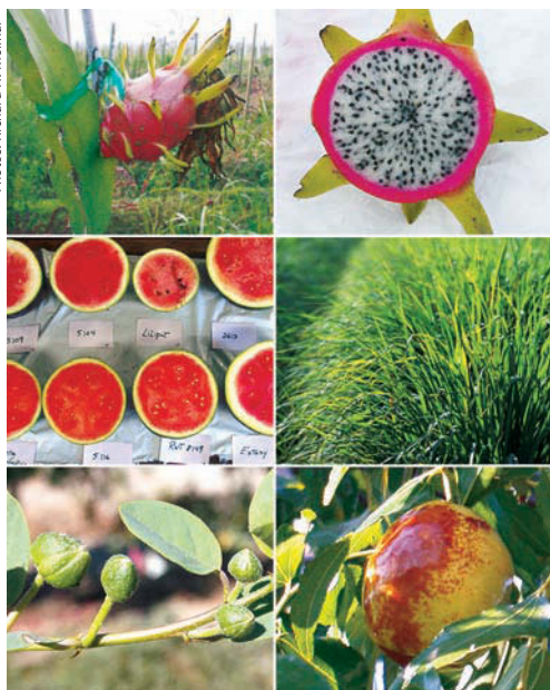
New specialty crops (clockwise from top left): dragonfruit (exterior and interior), lemongrass, jujube, capers, mini watermelons.

In a 2005 report, the Public Policy Institute of California predicts that the Valley population will double to more than 7 million by 2045.