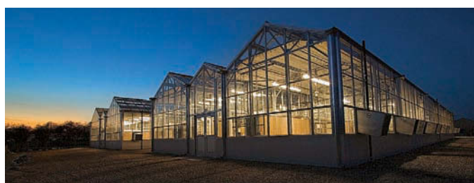
New greenhouses at night.