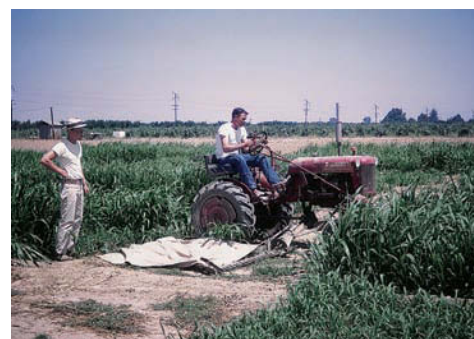
Sampling sudangrass plots in 1963.

potential of this unique farming area,” according to noted banker and agricultural economist Jesse Tapp ( Reedley Exponent , June 2, 1965). Challenges included irrigation management, alkali soils, pests and diseases, evaluating new tree and vine varieties, and developing rootstocks with resistance to nematodes and disease.