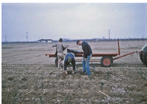
Tea plantings in 1965 were sponsored by Lipton.

The research center has brought together the laboratories, fields and collective brainpower needed to solve the most pressing problems of soil, water, fruit growing and pest management.