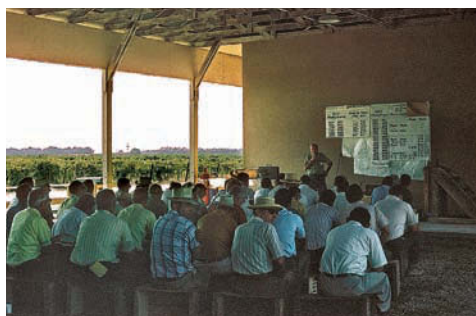
“Grape Day” brings growers to the center in 1974.