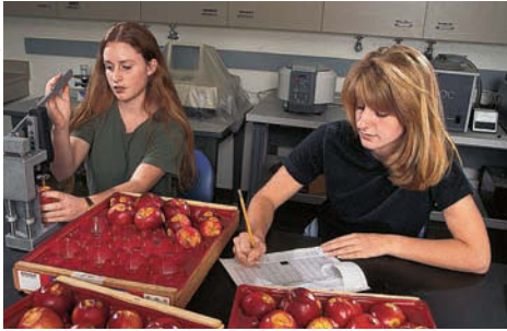
Postharvest research, 1995.

Mating disruption research leads to control of oriental fruit moth in stone fruit, in the 1990s.