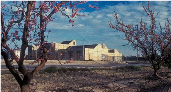
The current main office and laboratory building was dedicated in 1989.