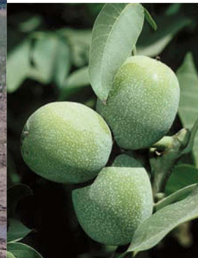
Early crops at the center included walnuts (shown), plums and grapes.