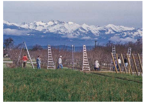
Winter pruning of orchard trees, February 1997.

Today, nearly 70% of the California wine and grape concentrate crush, 95% of California raisins and 90% of the state's table grapes are grown in the San Joaquin Valley.