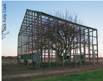
Left, the dormant tree can be seen through open framework. Right, a frame covered with plastic protects the tree from outside pollen during bloom period.