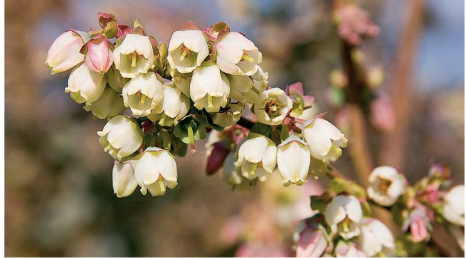
Field trials showed that Southern highbush blueberry cultivars are well adapted to the San Joaquin Valley. These new cultivars, such as 'Reveille', above , begin flowering in late winter and open a harvest window from early May through the Fourth of July.