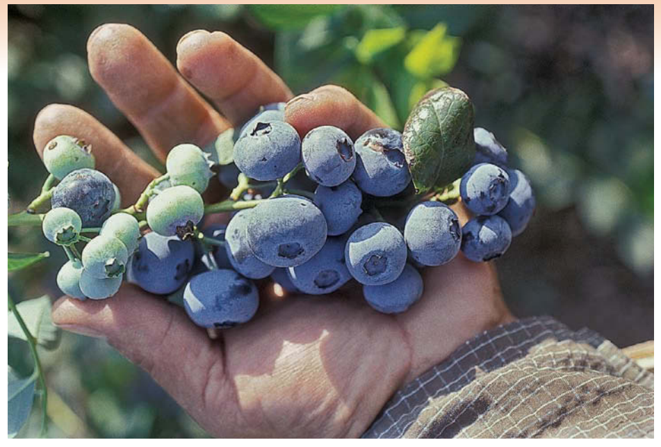
Blueberries historically have been grown mostly in the cooler regions of the United States. The recent development of new low-chill cultivars such as 'Legacy', above , in concert with innovative growing techniques and strong consumer demand have created an important specialty crop for the San Joaquin Valley.

ue to overproduction, market prices for many crops have been depressed for several years, resulting in the removal of thousands of acres of citrus, stone fruits, grapes and olives in the San Joaquin Valley. More than ever, growers are seeking new crops to plant, and many are focusing their attention on specialty or alternative crops. Observational trials indicate that new southern highbush blueberry cultivars are well adapted to San Joaquin Valley conditions. These initial trials and other ongoing studies will improve the likelihood of establishing this crop in the semiarid valley, a region not traditionally known for blueberries. However, prudence is appropriate, since blueber-