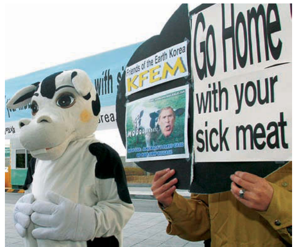
Left, a Canadian rancher herded healthy calves in south-western Alberta; Canadian authorities have reported three cases of mad cow disease since 2003. Above, on Dec. 30, 2003, protesters met a U.S. delegation arriving in Seoul to discuss mad cow disease with South Korean officials; South Korea banned U.S. beef imports following the discovery of the first confirmed U.S. case.