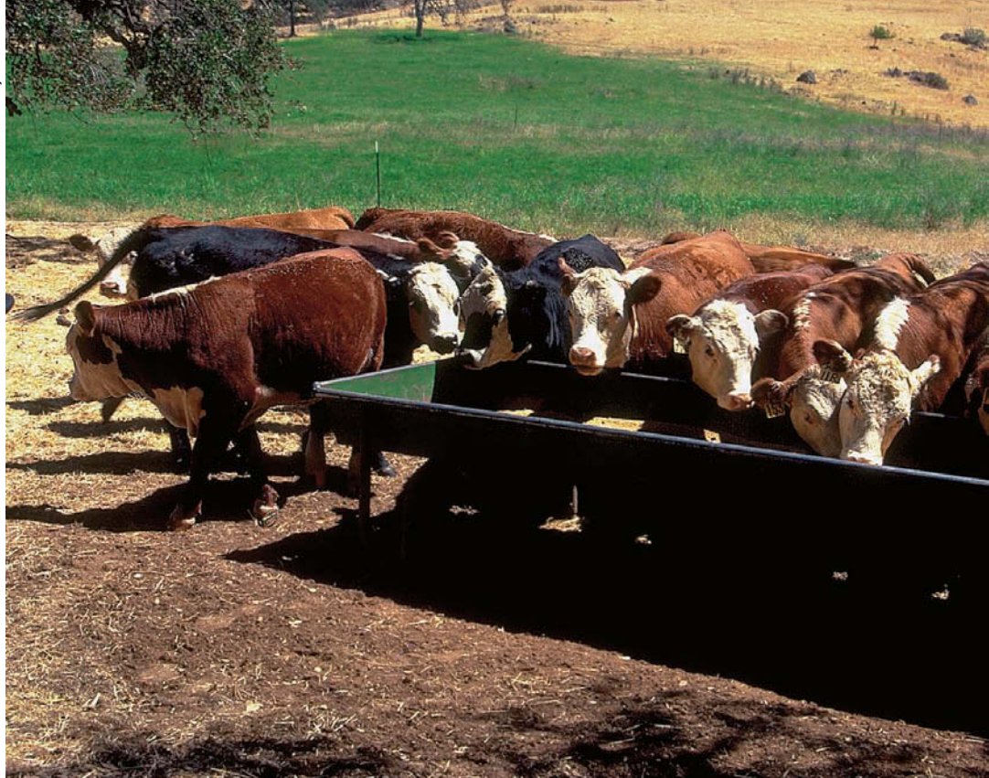
The scientific consensus is that BSE is transmitted via contaminated cattle feed. Above, livestock feed at the UC Sierra Foothill Research and Extension Center.

Prior to December 2003, USDA tested the brain tissue of slaughtered cattle for BSE solely via histological