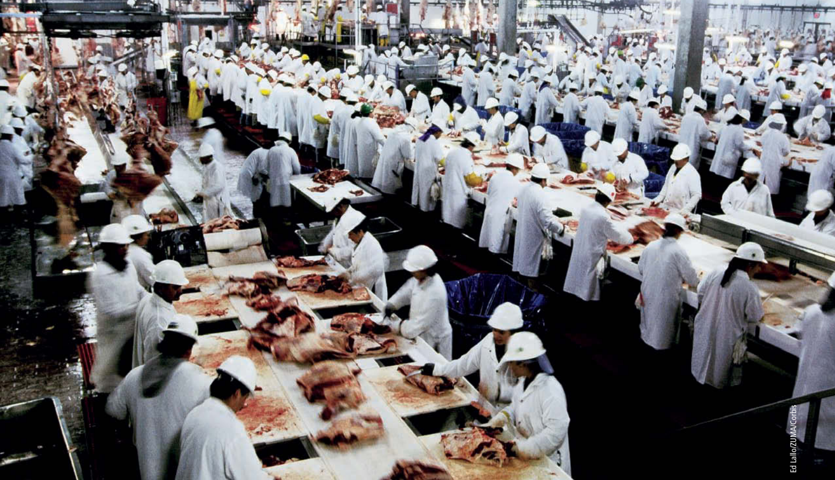
The U.S. Department of Agriculture is phasing out several common slaughterhouse practices, to ensure that specified risk materials (such as brain and spinal cord tissue) do not enter the human food supply. Above, lines of workers process beef at a Kansas meatpacking plant.

across Europe (Jasanoff 1997; Powell and Leiss 1997).