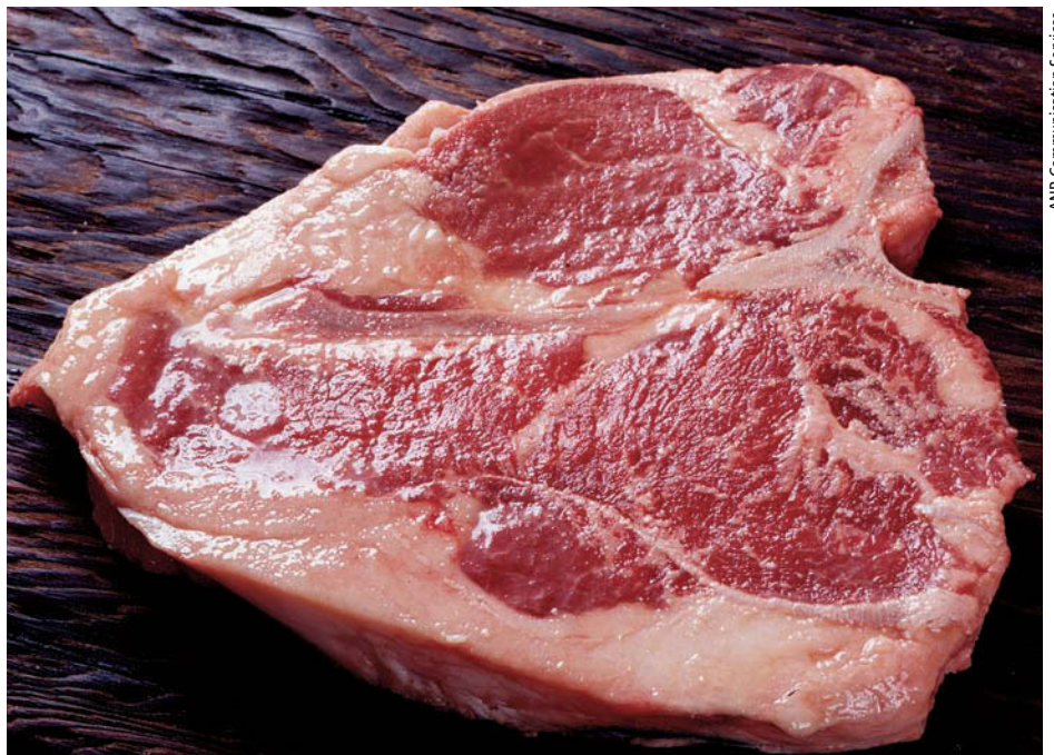
So far, the two confirmed U.S. BSE cases have not significantly shaken consumer confidence in the safety of homegrown beef.

The U.S. administration is currently engaged in actively wooing back former import partners, particularly Mexico and Japan. After months of negotiations, in October 2004 the United States and Japan announced they had reached a tentative framework agreement that would allow the beef trade between the two countries to resume within 12 months ( New York Times , Oct. 24, 2004). Part of this deal involved Japan ending its policy of blanket testing for BSE, a move opposed by many Japanese consumers. But this deal remains vulnerable. Although the second U.S. BSE case did not change Japan's position, no timetable has yet been set for this ban to be lifted. New U.S. BSE policies, most particularly the strengthened feed and SRM ban, remain heavily contested by the beef industry, and, although the new testing program has been put in place, other protective mea-