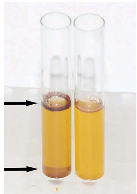
Comparison of the visual appearance of tubes containing test fluid of feed sample no. 5, spiked to attain 5% bovine dried blood (BDB) (left) and an unspiked sample (right). The presence of BDB in fluid to be tested by the Reveal assay is readily identifiable on the left. Blood cells are floating at the interphase (arrow) and suspended in the fluid and sediment (arrow). Since the antibody incorporated in the Reveal test strips does not cross-react with blood cells, the same sample (5% BDB) tested negative. Samples of all five feeds spiked to attain only 1% BDB tested positive with the real-time PCR technology, which detects the bovine mitochondrial DNA in nucleated white blood cells.

Despite the obvious disadvantage of not being a field test, real-time PCR offers a considerably lower limit of detection and greater accuracy. The indirect costs of the antibody test could be large if the result was a false negative in the field that was ultimately confirmed positive in the laboratory (Wyatt 1992), even if the contaminated feed did not