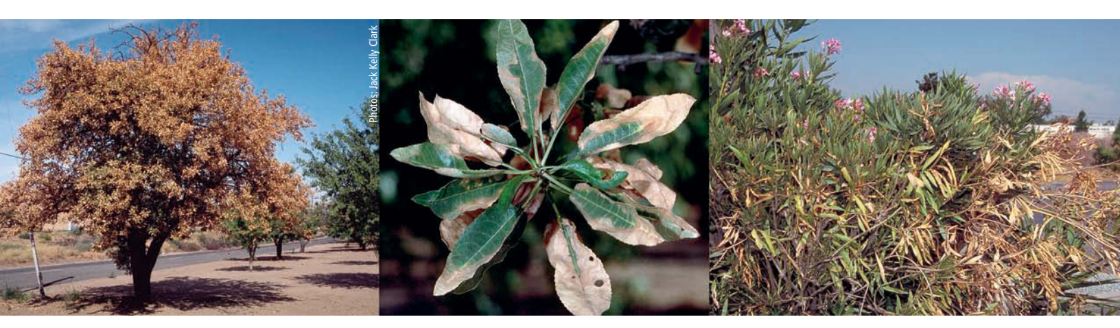
Almond leaf scorch, left and center , is a relatively slow-spreading disease that may take many years to establish in cropping systems. Right , oleander leaf scorch is causing millions of dollars of damage to California's freeway median strips and other ornamental plantings.

a single age showed that progeny production was greatest from GWSS eggs 3, 4 and 2 days old for G. ashmeadi, G. triguttatus and G. fasciatus, respectively. Furthermore, each parasitoid species was able to utilize a range of egg ages around their most preferred age: 1 to 4, 3 to 6, and 1 to 3 days old for G. ashmeadi, G. triguttatus and G. fasciatus, respectively. GWSS eggs that were parasitized at 8 to 10 days of age produced few parasitoid progeny and those that did emerge had been oviposited into sterile or dead host eggs lacking a GWSS embryo (Irvin and Hoddle 2005a). This suggests that the low production of parasitoid progeny in older GWSS eggs was most likely due to the advanced stage of development of the GWSS embryos.