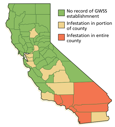
Fig. 1. GWSS establishment in California counties and infested parts of counties.

Two of these species ( G. morrilli and G. ashmeadi ) are already established in California. G. morrilli is native to California and G. ashmeadi is self-introduced from the southeastern United States (with no direct assis-