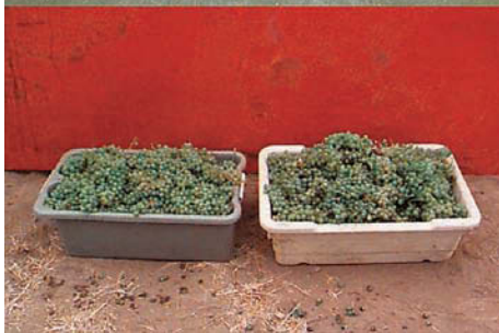
Top , the authors fitted workers with an exoskeleton called a Lumbar Motion Monitor to study their movements during a simulated hand-harvest of grapes. Middle , the intervention tub (left) and standard tub (right). Note the smooth bottom and added handles on the intervention tub. Bottom , the intervention tub holds an average of 11 pounds less grapes than the standard tub.