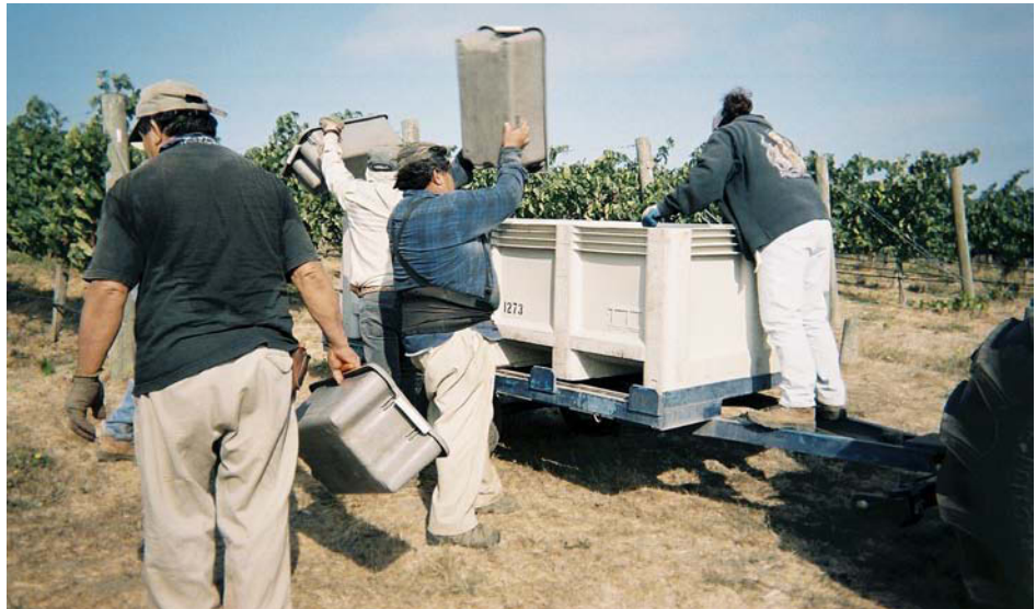
Grape-harvest workers typically dump their full tubs into the gondola 18.75 times per hour; the smaller intervention tub is lighter but must be lifted about 21.68 times per hour. While workers in this study delivered about 168 pounds less grapes per 8-hour shift with the smaller tub, neither they nor their bosses perceived a productivity decline because the reduction was small (only 2.5%).

The intervention tubs were 13% smaller in volume than the standard tubs, resulting in a seasonal average reduction in load weight of 11 pounds (from 57 to 46 pounds) for the tub and its contents. While this is a relatively small weight decrease, it brought average loads below the 50-pound threshold. However, because the intervention tub was smaller, workers would have to make more lifts and carries during each shift to maintain their productivity, as measured in tons of grapes. The intervention tub filled in slightly less time than the standard tub: an average of 2 minutes 46 seconds versus 3 minutes 12 seconds. This means that lifting frequency was slightly greater for the intervention tub than for the standard tub: 21.68 lifts per hour versus 18.75 lifts per