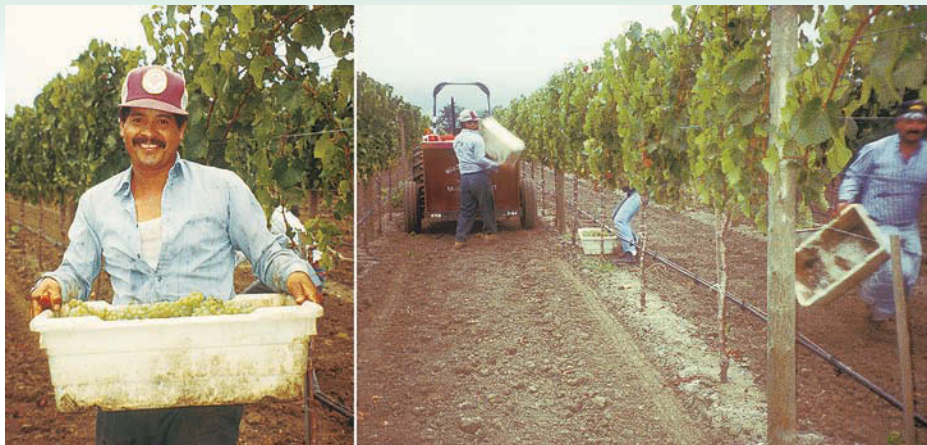
In wine grape vineyards, harvest workers suffer from a high rate of musculoskeletal disorders. Switching to a smaller picking tub can reduce the level of reported symptoms without significantly affecting productivity.

Total costs for a first-time back injury can reach $10,000, with costs for repeated back injuries reaching as much as $300,000 (OSU Research News 2001; NRC-IOM 2001). With an average of 3,350 back injuries reported each year