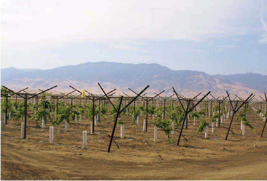
Boron deficiencies are common in the old flood plains and alluvial fans of California's Central Valley. Above, a newly planted table grape vineyard.

grapevines are susceptible to temporary boron deficiency of developing tissues during periods of drought, suggesting limited boron mobility.