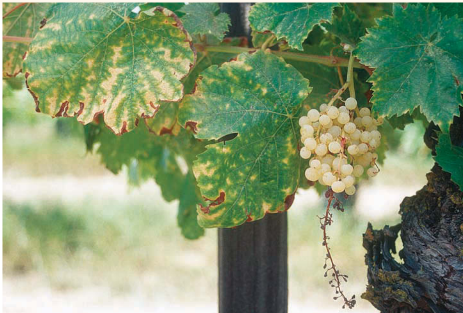
A boron-deficient Thompson Seedless cluster in the trial vineyard shows reduced fruit-set, the presence of numerous pumpkin-shaped “shot berries” and necrosis of some branching. Fewer than 10% of the berries are normal size and shape.

Grapevine reproductive tissues are most sensitive to boron deficiency, which results in reduced fruit-set, small “shot berries” that are round to