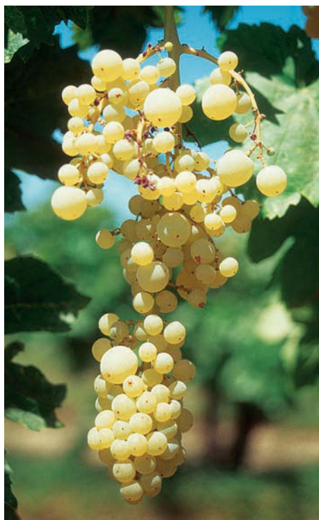
Boron foliar sprays applied in the fall were the most effective treatment to prevent, above, boron deficiency symptoms in grapes.

ments were an untreated control and a foliar boron spray at 1 pound per acre applied as Solubor (20.5% boron) at 100 gallons per acre (gpa). The trial design was a randomized complete block with four-vine plots, replicated 10 times. Vine tissue samples were taken at bloom on May 23, 1998; triple-rinsed with distilled water and oven-dried; and analyzed for boron at the ANR Analytical Laboratory at UC Davis.