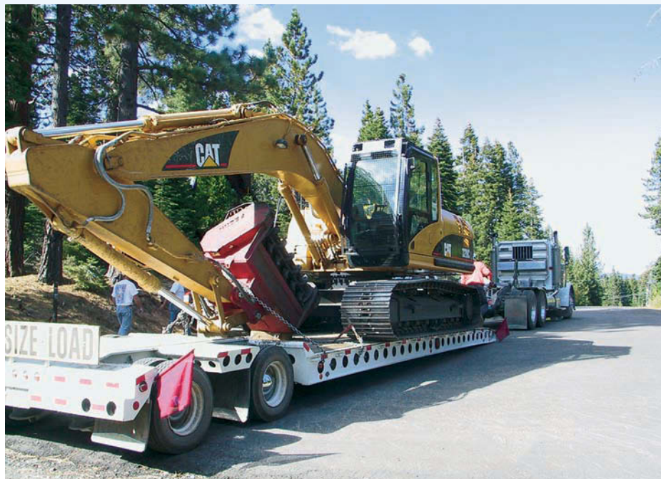
Mechanical mastication is a promising method for thinning overstocked forests. Above, a Fecon Bull Hog BH 80 masticator head is mounted to the boom of a Caterpillar 235 excavator.

Fires in these overstocked stands tend to be high-intensity “scouring” fires, which leave little intact understory and sterilize the soil. Loss of cover leaves bare soils extremely prone to erosion,