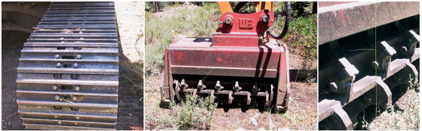
Right and center, the masticator grinds overstocked forest understory and leaves a layer of protective mulch. The authors evaluated whether the large machine's tread, left, contributes to soil compaction and subsequent runoff.

Plant and litter cover protects the soil from raindrop impact and splash, tends to slow down the movement of surface runoff, and increases the infiltration rate and water-holding capacity of the soil (Wall et al. 1987; Molinar et al. 2001).