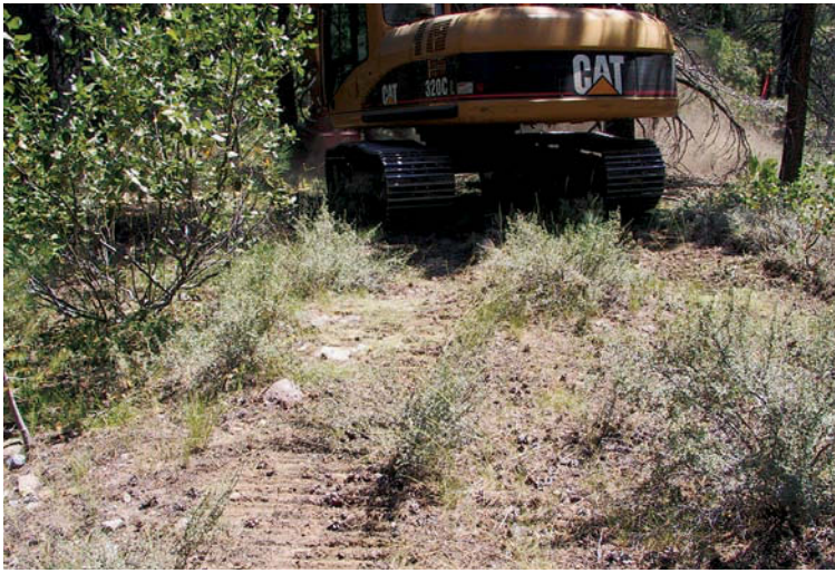
Above , runoff from masticated sites with granitic soils were much more likely to contain certain sizes of sediment particles than those from volcanic soils. Right , forests in the Tahoe Basin are severely compromised by the suppression of wildfires, disease and insect stress.