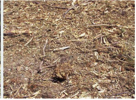
The study area in Tahoma, near Lake Tahoe, left , before and, center , after mastication treatment; right , the masticator grinds forest material into hand-sized chunks.

and greenleaf manzanita ( Arctostaphylos patula ) mixed with scattered forbs and grasses. Perhaps due to fire suppression, the forest floor was covered with at least 2 inches (5 centimeters) of needle litter, duff and other woody debris. In some areas, the mulch-duff layer was as much as 4 inches (10 centimeters).