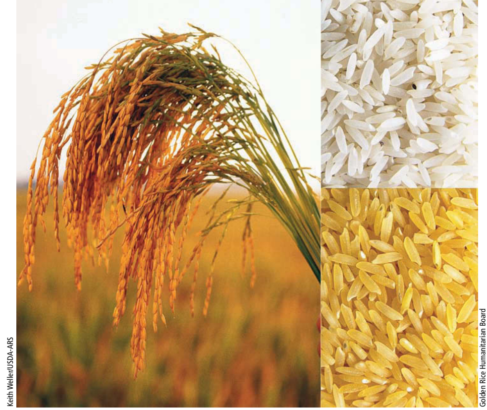
Due to market concerns, California rice growers are cautious about adopting transgenic crops that could cross with conventional varieties. Left , U.S. long-grain rice and, top right , rice grains. Lower right , "golden rice" is genetically engineered to accumulate pro-vitamin A in the grain, in order to help fight nutritional deficiency diseases in developing countries.

B. rapa typically have a drop in fitness relative to their parents, but that fitness is rapidly regained when those hybrids mate with one another or backcross to either parent. Only two genetically engineered types of canola are commercially available in the United States: plants engineered with resistance to the herbicide glyphosate and those engineered with resistance to the herbicide glufosinate.