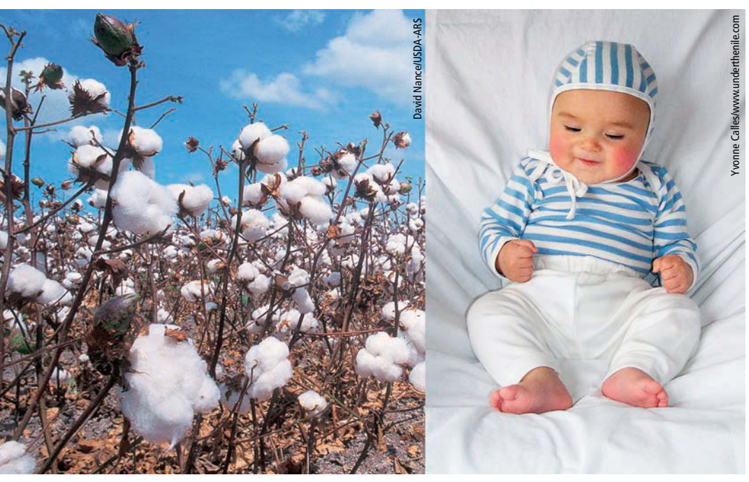
While organic crops must be transgene-free, cross-contamination of organic cotton by transgenic varieties is not expected to be a problem because seeds (which may contain genes from an engineered pollen parent) are removed from the lint (which is pure maternal tissue). Left, a cotton crop; right, baby clothes made with organic cotton.

We know that it is easy to lose track of transgenic genes — if pollen moves