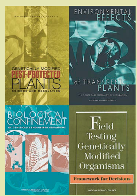
The National Research Council has published numerous science-based reports on the environmental risks and benefits of transgenic plants and food.

to deploy a pesticide through a plant that kills only a subset of insects than to spray one on a field that kills all insects willy-nilly?" The answer, of course, would be, "Yes, Bt in corn reduces environmental impacts relative to spraying broad-spectrum insecticides." However, prior to the advent of Bt corn, many American corn farmers did not spray insecticides to control the pests controlled with Bt (NRC 2000). Those farmers simply took their chances without any control, possibly because the damage from the lepidopteran pests of corn varies so much from one year to the next. In the latter comparison, the addition of Bt, if it carries adverse nontarget effects, does pose a new problem.