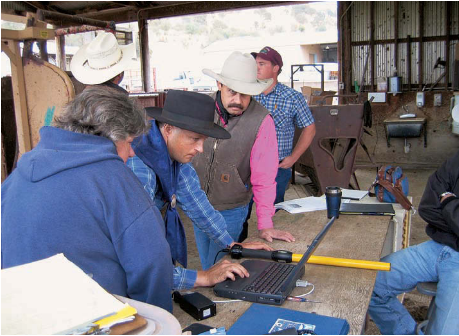
The adoption of modern technologies is becoming increasingly important for the success of commercial livestock operations. Above, researchers at the UC Sierra Foothill Research and Extension Center use DNA tests and electronic animal identification equipment to individually track the parentage and performance of each animal and identify genetically superior breeding stock.

ing objectives. If biotechnology makes farm animal production more efficient, this may have the effect of worsening conditions that some already see as unacceptable, such as those found in concentrated animal-feeding operations. This concern is again not unique to genetic engineering, because any genetic selection program directed exclusively toward high production efficiency has the potential to cause welfare concerns for farm animals, irrespective of the techniques used to obtain that goal. Conversely, animal biotechnology might also be used to improve traits such as disease resistance, which could have the effect of decreasing animal suffering or mortality.