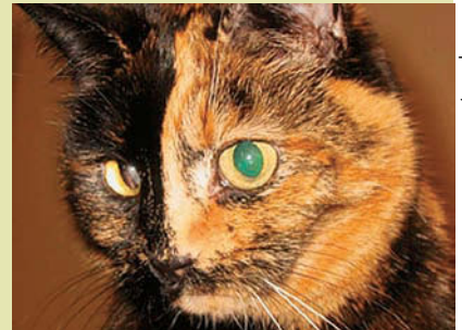
Epigenetic changes are visible in tortoiseshell female cats. Depending upon which X-chromosome becomes inactivated, some skin cells give rise to orange fur while others give rise to black fur.