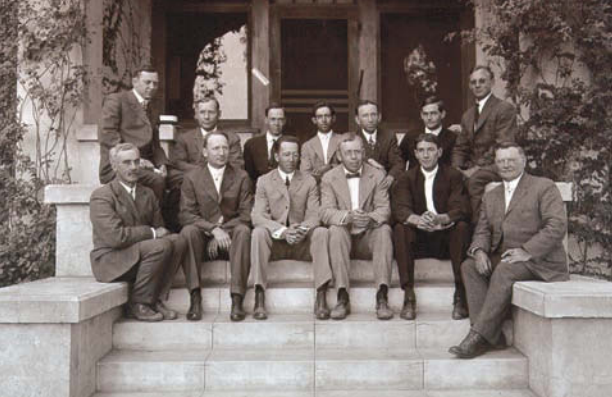
Far left, the parasitic wasp Gonatocerus triguttatus was evaluated at the Citrus Experiment Station (CES) for biological control of the glassy-winged sharpshooter. Left and above, in 1918, CES moved from Mt. Rubidoux near downtown to the site that would become UC Riverside.