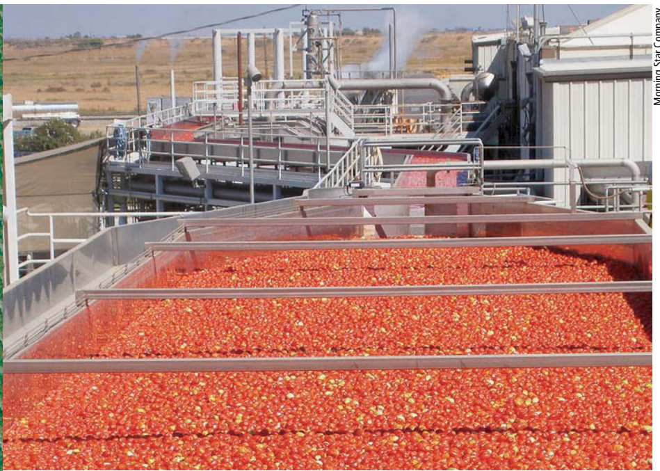
Morning Star Company