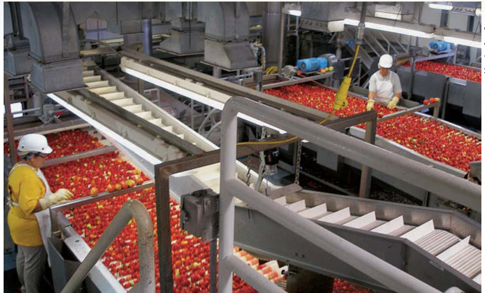
Morning Star Company

California produces 95% of the processing tomatoes grown in the United States, and the processing tomato industry is an important component of California agriculture. Its total revenue was $670 million in 2004, ranking processing tomatoes 11th among all agricultural commodities produced in California (USDA 2005). Processed tomato products are also a major California export commodity.